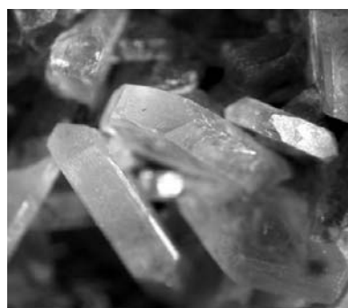
Fig. 2: Barite from breccia. Majdán Saddle, Csobánka.

have open spaces therefore the crystals are usually euhedral. Barite crystals most commonly have simple orthorhombic-tabular morphology in most of the thin veins, however, a definite zoning in distribution of various habits of barite was observed in the major and thickest vein (approx. 2 m in thickness) on the Majdán Saddle. There the first phase of the crystallization of barite was related to the brecciation of sandstone and the habit of crystals is determined by pyramidal and prism faces in addition to the {001} form (Fig. 2).