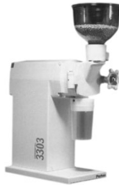
Fig. 2. Perten 3303 disc mill (Perten, Inc.)

Grain samples were grinded by Perten 3303 for establishing the e_g using a 1-phase output indicator interface. This involves grinding a sample, and sieving a weighed amount (usually 10 g) through a standard screen for a standard time. The percentage of throughs is recorded as the PSI. (Gyimes, Szabo, 2008)