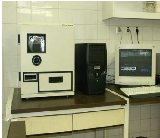
Fig. 1. SKCS 4100 instrument (Perten, Inc.)

and moisture content, as well as the HI. This machine examines 300 whole kernels. (Szabo et al., 2005; Bean et al. 2005)