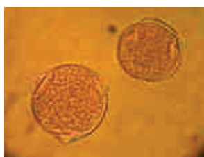
Photo 1. Pollen grain of summer seed watermelon.