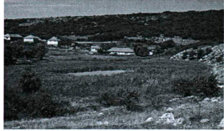
Photo 4 Aggtelek lake in 1999