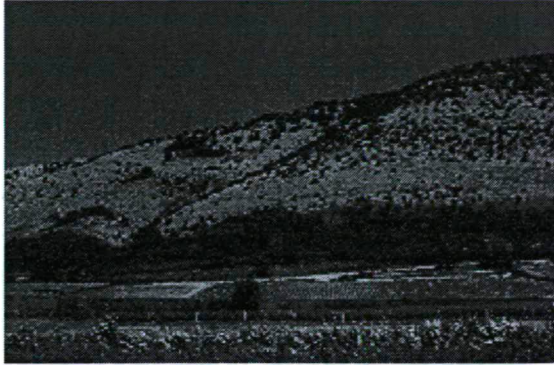
Photo 2 Erosion slope in the Villányi Mountains