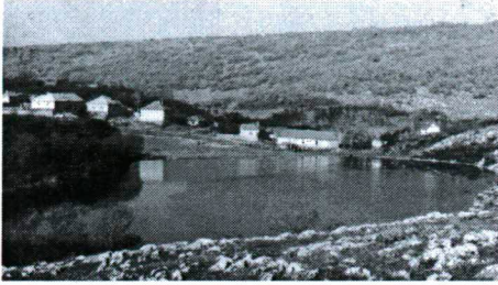
Photo 3 Aggtelek lake in 1984