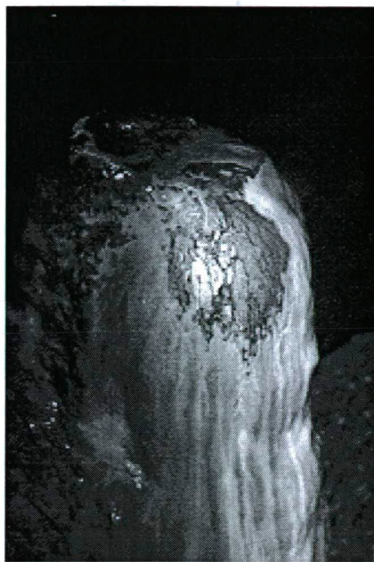
Photo 1 Redissolution of a dripstone in the Baradla Cave (Aggtelek Karst)

Evaluating ecosystem services may help improve water quality, because the investments needed may be financially comparable with 'the price' of maintaining the present state. E.g. in 2006, thousands of people were taken ill because of the polluted water during a karst flood, and some karst springs were excluded from the drinking water supply in the surroundings of Miskolc, because of coli infection (Lénárt 2006). If we take into consideration the damages in other services, the total costs of interventions needed, these are financially comparable with the consequences of worse environmental status. Water Quality Trading (Boyd et al. 2004) could be a usable method in environmental management of surface and subsurface waters: it works similarly to the carbon trading system: polluters above the limit can buy emission surplus quotas from companies with less pollution.