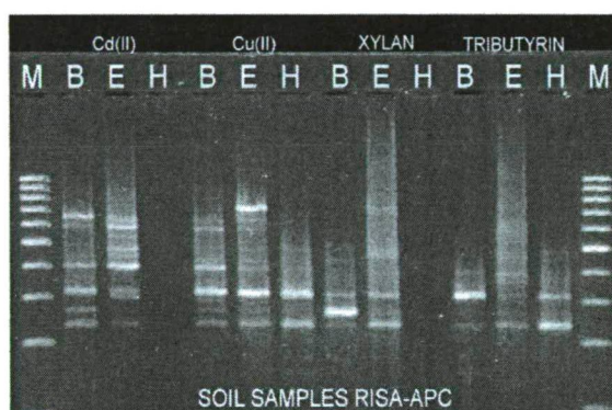
Figure 2. RISA-APC profiles from different soils. B-wheat field, E-forest soil, H-sandy soil. Cd(II) and Cu(II): the lines of metal resistant bacterial communities.

Fingerprint experiments showed high reproducibility, no difference were detected between replicates of RISA profiles obtained from amplifications of triplicate DNA extracts. The RISA-APC profiles were manually compared. The number of bands observed is summarized in Table 1 .