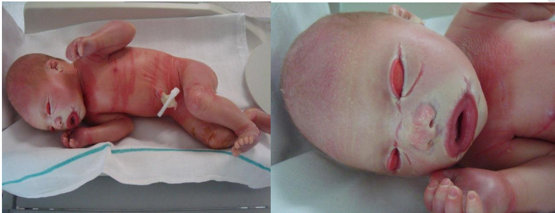
Figure 1: Physical examination of the neonate showed a thick keratin-coated skin with fissures. Restricted moving of hands and feet was noticed. There was eclabium (eversion of the lips) and bilateral ectropion.