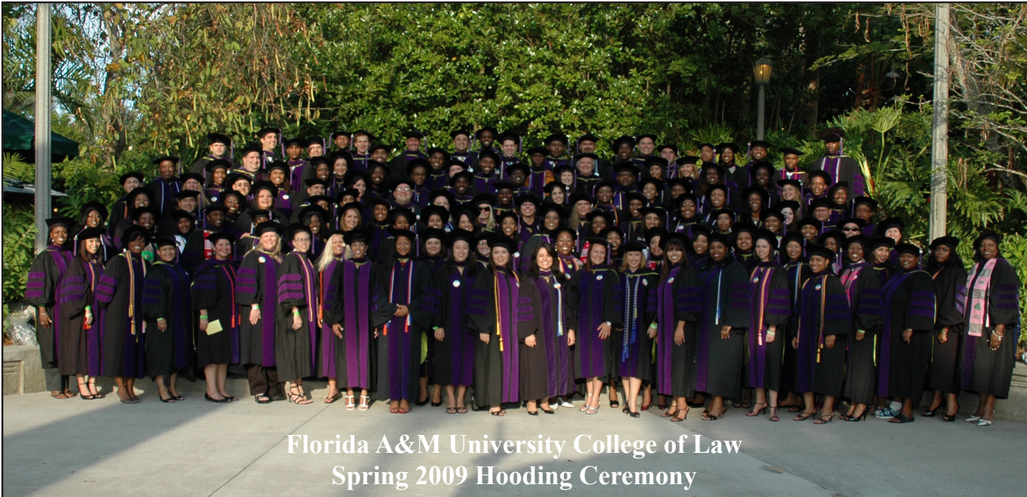
Florida A&M University College of Law Spring 2009 Hooding Ceremony