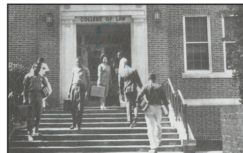
The ABA's decision for full accreditation comes nearly 60 years after the original College of Law was established in Tallahassee.