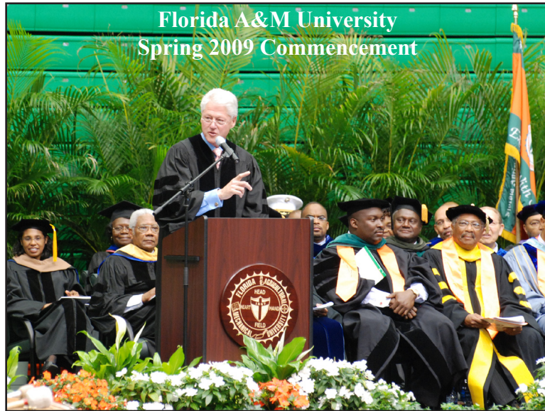
Florida A&M University Spring 2009 Commencement