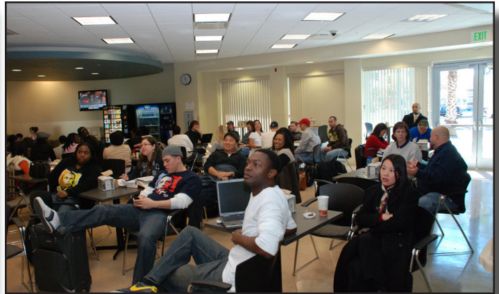
FAMU Law students and faculty gathered at various locations throughout the law school campus to watch live broadcasts of the swearing-in of Barack Obama as the 44th President of the United States.