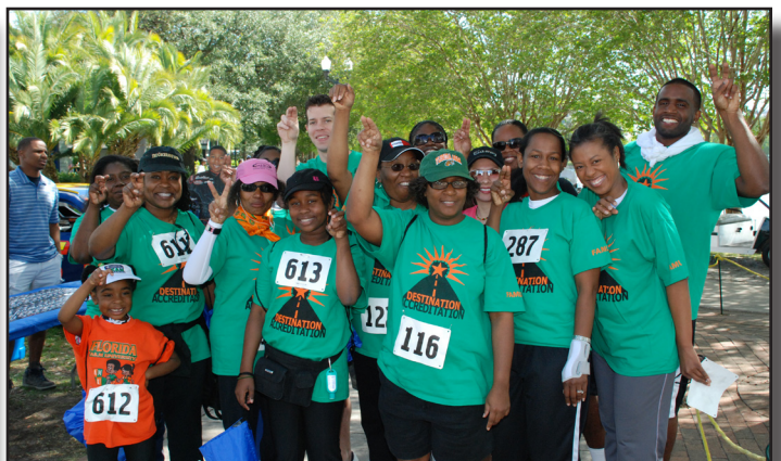
A group of FAMU College of Law students, faculty and staff sporting commemorative Destination Accreditation T-shirts participate in the Tom Joyner TJ2K Walk/Run in April at Lake Eola.