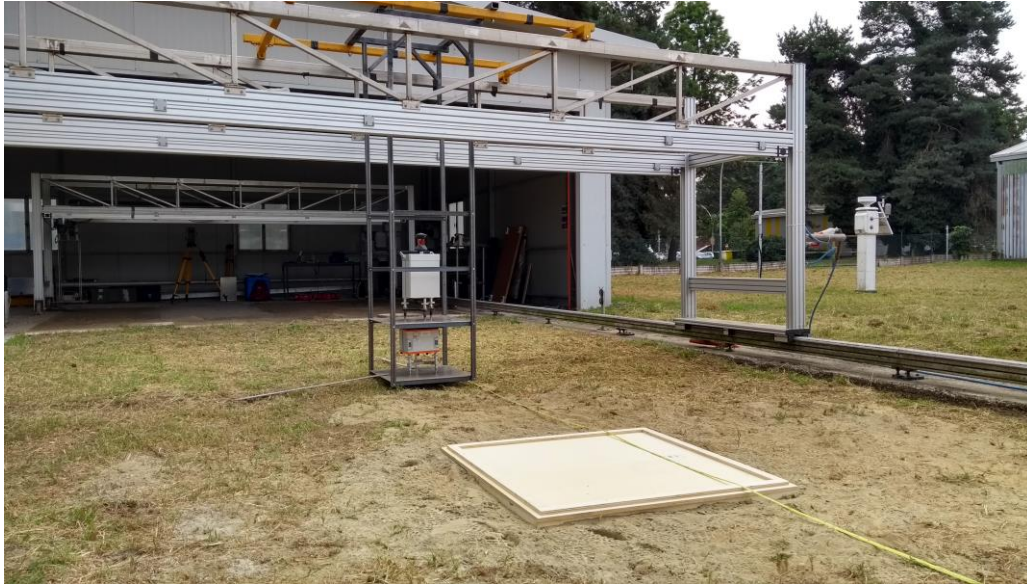
Fig. 1 CG5 gravimeter mounted vertically above CG6, suspended from gantry over test lane, adjacent to the test mass pit covered by the plywood lid. Theodolite prism is visible on top of the CG5. Yellow tripod of the total station is visible at the back of the hangar.

Gantries, mounting frames, Leica TP 1200 total station theodolite, 5 ton lead test mass, Venieri S23F back-hoe excavator (JRC)