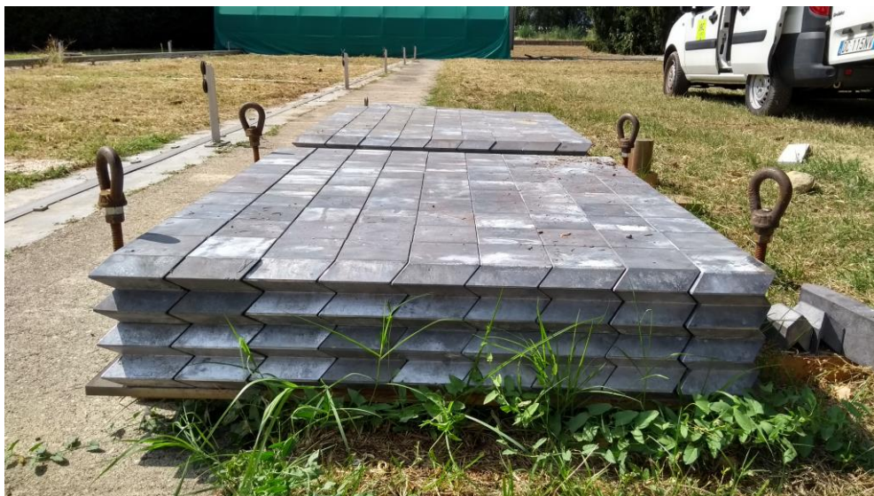
Fig. 2 Lower two sections of the test mass, each consisting of a double layer of lead bricks on a steel plate with screw holes for handling rings. The upper section, not shown, consists of a single layer.