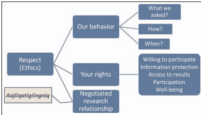
Figure 2. Ethical Principles in Research

Figure 2 represents ethical principles usually promoted in academic research. We opted for “respect” to emphasise what we meant by “ethics” and to highlight the importance we attached to the relational dimension of ethics in research. While the list of concepts represented in these diagrams is by no means exhaustive, they brought attention to our duties and their rights (i.e., “informed consent,” “confidentiality,” “transparency,” “ownership,” “participant protection”). These notions were translated, respectively, into “willing to participate,” “information protection,” “access to results,” “participation,” and “well-being.” It was an attempt to verify whether we could link some of the more conventional Western-centric ethical concepts with Indigenous approaches.