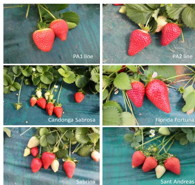
Fig. 1. Strawberry fruits of the tested genotypes

According to the second objective of this study, we tested the fruit physic-chemical nutraceutical characteristics of two experimental strawberry lines and four established cultivars in response to different postharvest fruit storage temperatures. Commercially mature fruits were harvested according to fruit dimension, colour and glossiness. Immediately after harvesting 10 fruits per replication and genotype from the January harvest were subjected to 20 or 4 °C for 36 hours into a climatic chamber (Model T; Biemme s.a.s.; Rome; Italy). The experiment was defined by a factorial combination of six genotypes (G) and two fruit storage conditions (S) (20 or 4 °C). A randomized block experimental design with four replicates per treatment was adopted. A two-way fixed-effects general linear model analysis of variance (ANOVA) was used to determine the effects of different genotypes and storage conditions. Mean separation was performed by Duncan multiple range test. Percentages were subjected to angular transformation prior to perform statistical analysis ( \Phi = \arcsin(p/100)^{1/2} ). Data obtained were statistically analyzed using SPSS software version 14.0 (StatSoft, Inc., Chicago, USA).