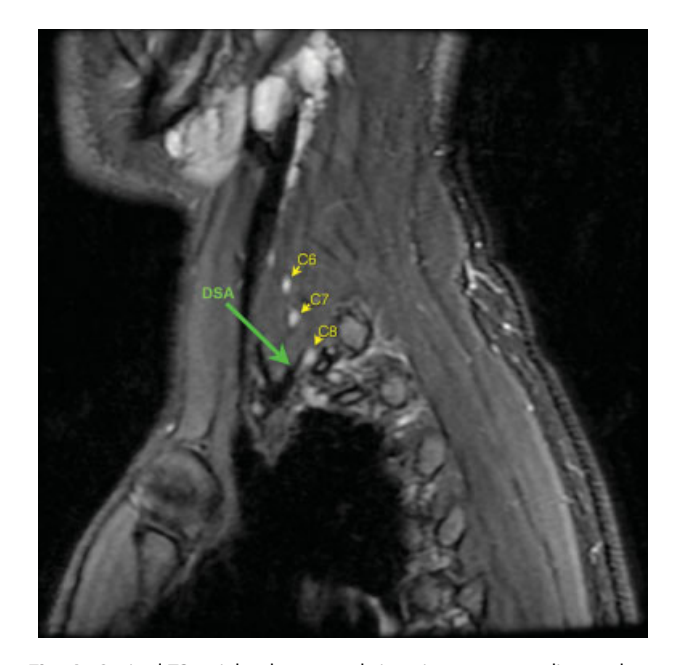
Fig. 1 Sagittal T2-weighted, water-only imaging, corresponding to the coronal T2 image. The hypointense branching structure indicated by the arrow is the putative dorsal scapular artery branching off the subclavian artery, which is impinging on the proximal C8 root. MRI acquisition was performed on GE (Waukesha, Wisconsin, United States) 3T magnet using the IDEAL sequence. Water-only images are presented. Acquisition was performed with T_{\rm E} = 60 ms and T_{\rm R} = 7,907 ms.

Evaluation by MRI showed a possible vascular/fibrous band over the lower trunk of the brachial plexus distal to the first rib. Fig. 1 illustrates this relationship using a parasagittal IDEAL T2-weighted sequence, where a linear hypointense structure is seen traversing on top of C8 (arrow). This proposed vascular/ fibrous band has an apparent connection with the adjacent subclavian artery, consistent with designation as the DSA. Combining MRI findings with patient's description of symptoms, a working diagnosis of TOS was made. The patient underwent physical therapy for 3 years, with very modest improvement of symptoms. On the basis of worsening symptoms, lack of response to physical therapy, and patient's desire to play competi-