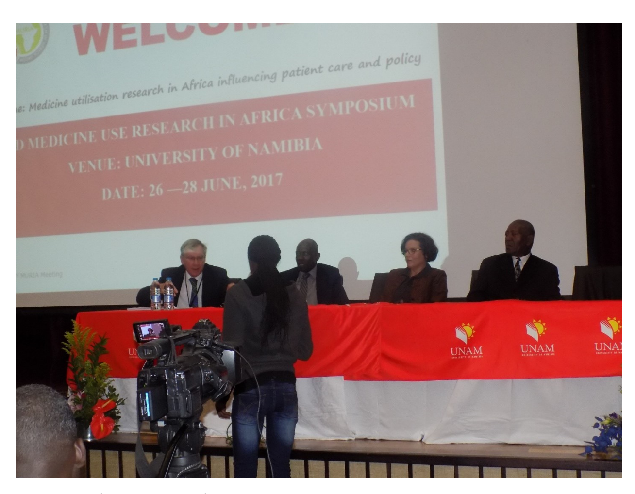
The Press Briefing at the close of the meeting on day 3.