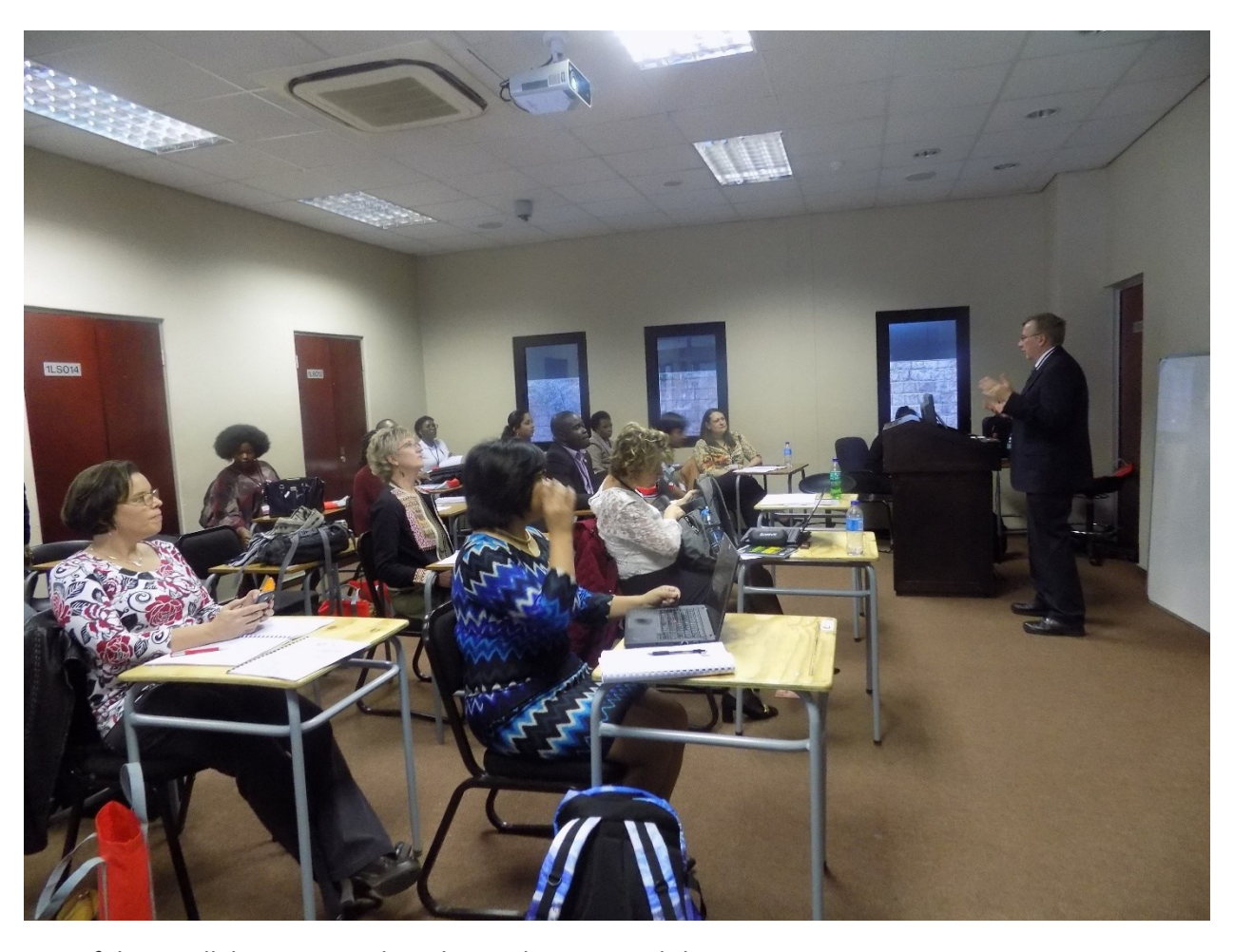
One of the parallel sessions in the Advanced Group workshops