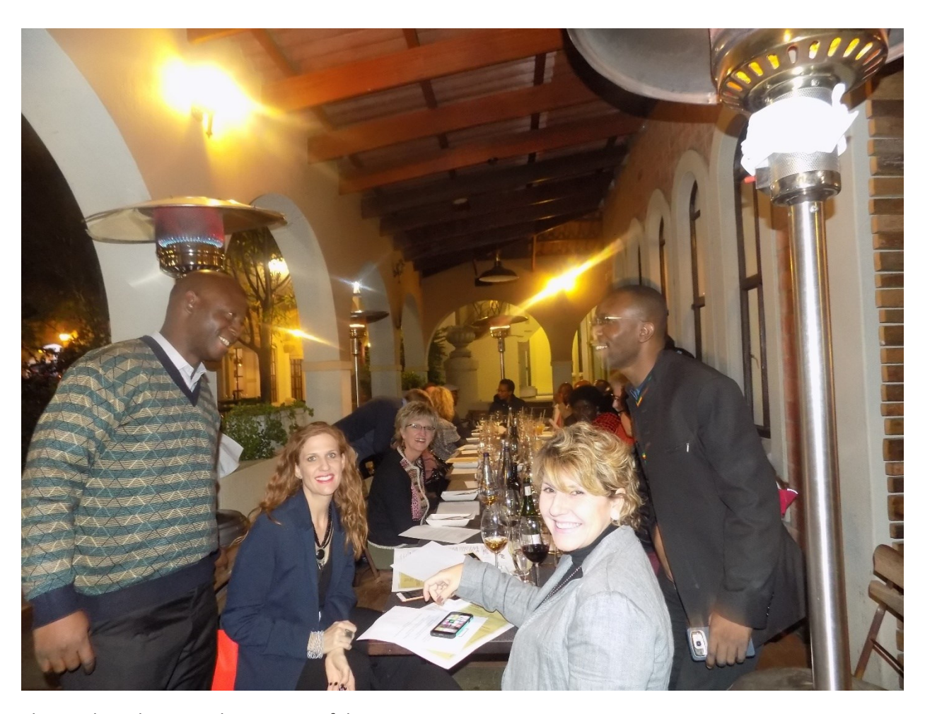
The outdoor dinner in the evening of day 1