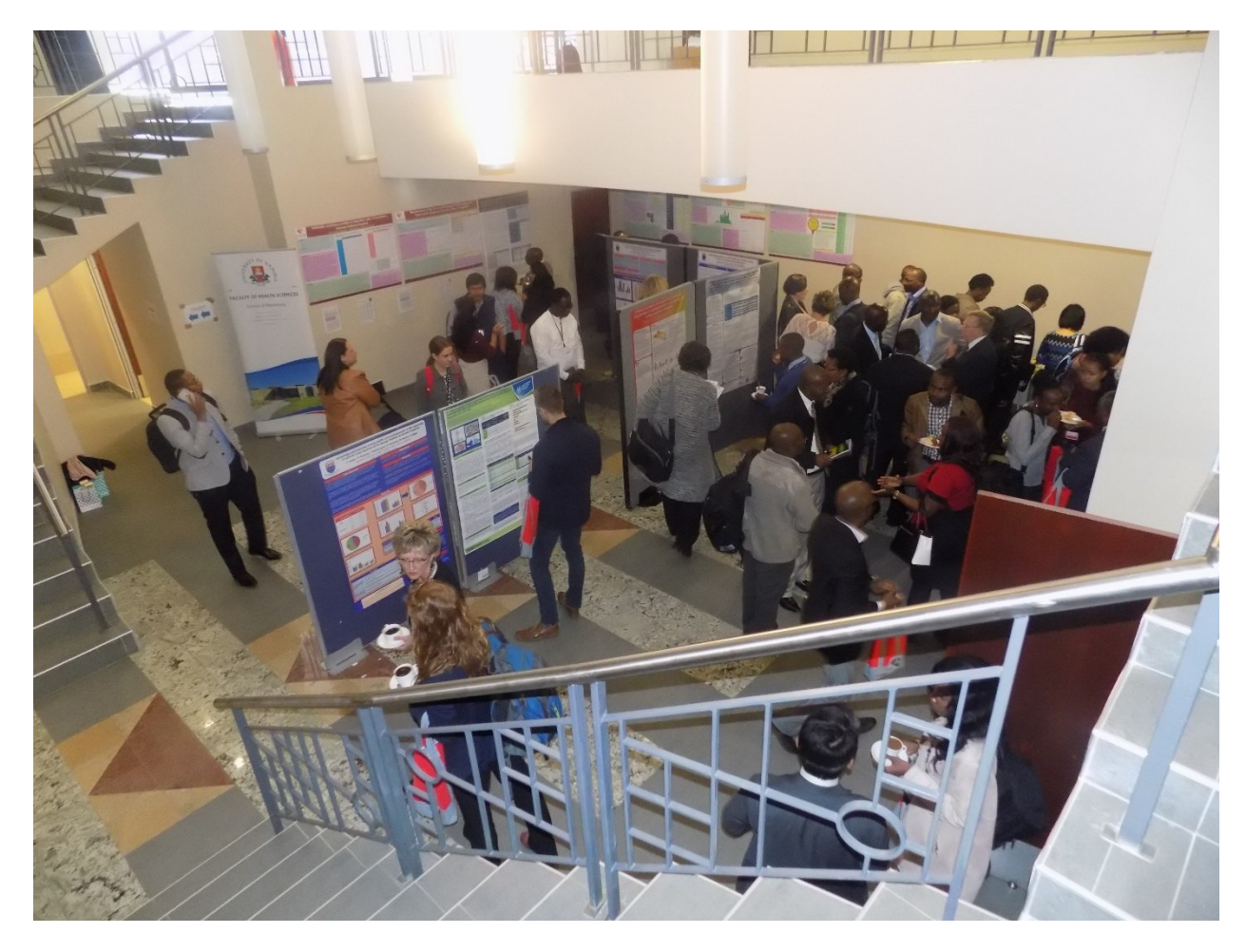
A Poster Session