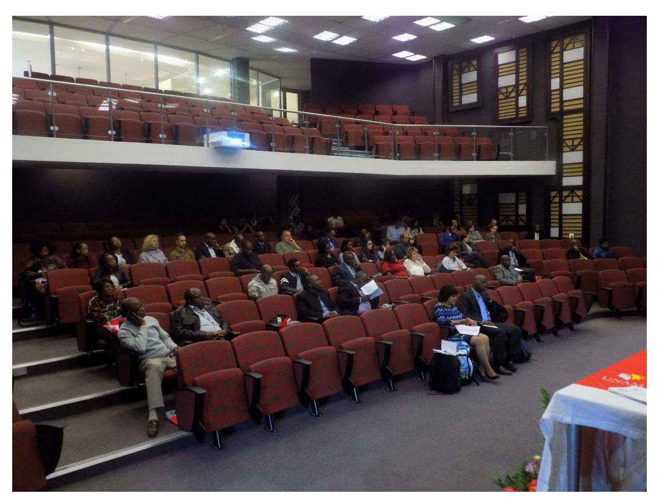
A Cross Section of Participants at the meeting

The meeting featured over 35 oral and over 30 poster presentations, and ended with a consensus session on the way forward for the group on future directions and agreements on potential studies, publication strategies and funding sources. Specific areas of common research interests were identified and working groups constituted for each respectively. The meeting was adjudged by participants to be highly interactive and impactful with improved quality of presentations compared to the previous editions. Participants departed Windhoek in high spirits looking forward to next MURIA Group meeting in 2018 at the same venue.