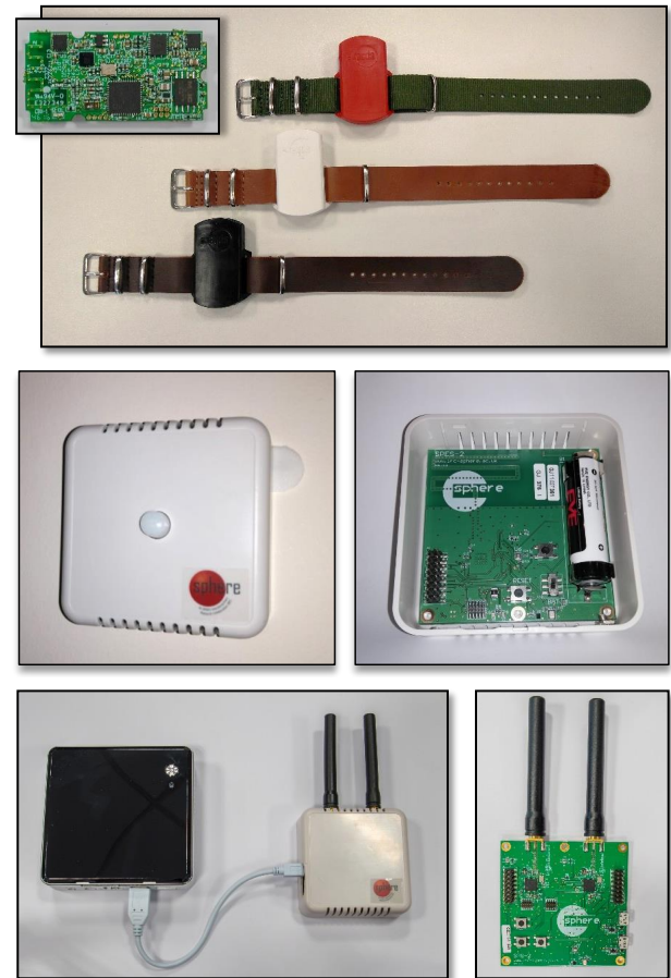
FIGURE 1: The bespoke SPHERE platforms that are being deployed in the houses of participants as part of SPHERE's 100 homes study: the SPHERE Wearable Sensor, SPW-2 (top); the SPHERE Environmental Sensor, SPES-2 (middle); the SPHERE Gateway, SPG-2 (bottom).

Inspired by [7], Hnat et al. [8] published " The Hitchhiker's Guide to Successful Residential Sensing Deployments ", focusing on indoor sensor deployments instead. Indeed, the authors share experiences from deploying more than 1200