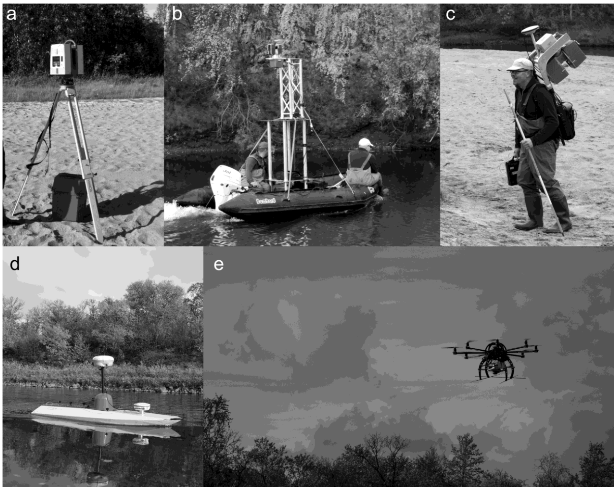
Fig 4. Examples of modern empirical measurement equipment: a) terrestrial laser scanner is used for very accurate topographical mapping; b) Boat-based mobile laser scanner is efficient in mapping river bank; c) backpack-based mobile laser scanner allows access to variety of places and enables fast collection of detailed topographic data; d) ADCP and RTK-GPS attached to remotely controlled boat allows for spatially continuous flow and bathymetric measurement; e) drones have become an increasingly popular measurement platform carrying, for example, digital cameras and laser scanners.