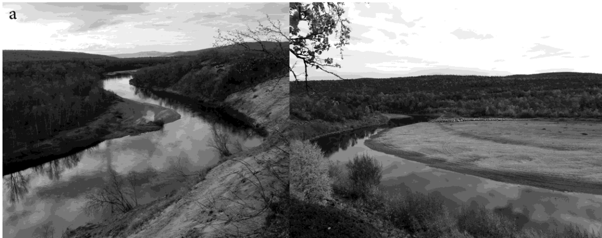
Fig. 1a) A meandering river consisting of sequential bends with steep outer banks and shallow inner banks. b) The shallow and wide point bar on the inner bank.

Thereby, the aim of this paper is to complete these recent comprehensive reviews by focusing on the potential benefits and shortcomings of the modern empirical and modelling approaches in deepening understanding of the sub-bend-scale fluvial geomorphology of meander bends. Our study is focused on key research questions concerning sub-bend scale processes in meandering rivers, which still remain partly unexplained but to which recent studies have given new insights: (1) What controlling factors interact during meander development and how are they interconnected? (2) Are the sub-bend-scale processes of the bends predictable or consistent?