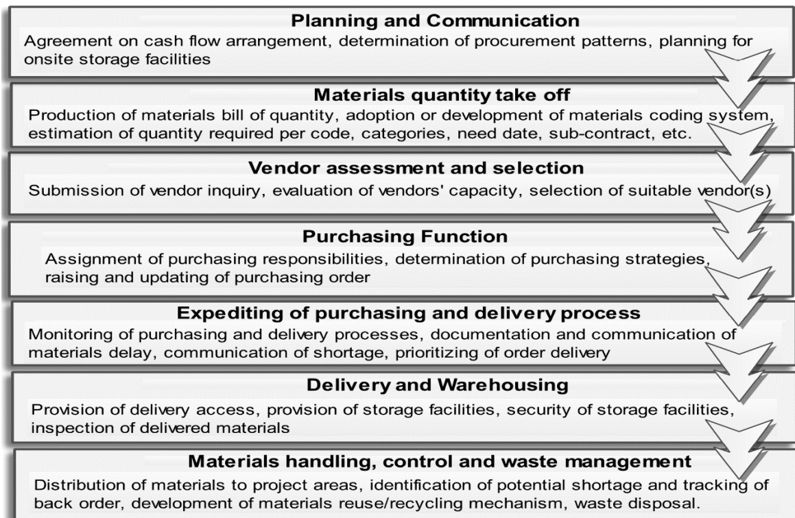
Figure 1: Key stages of materials logistics management in construction projects

usually involves a number of stages including materials take-off, bill of materials, warehousing and the actual use of the materials. At the early stage, an effort is required to ensure that the materials take-off is accurately made from project specification in order to prevent error in ordering (Bell and Stukhart, 1986). The increasing use of Computer Aided Design (CAD), and specifically the use of BIM tools for materials take-off, is continuously facilitating efficient estimation of materials required for building activities. Nonetheless, this largely depends on the accuracy of the drawing documents and adequate coordination of drawings between various professional parties involved in modern-day designs (Monteiro and Martins, 2014).