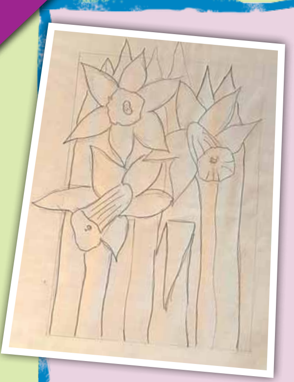
A pencil sketch of daffodils and the finished silk painting

Painting flowers on silk is a delightful way for children to combine making detailed observations of flowering plants with learning about and practising the ancient art of silk painting.