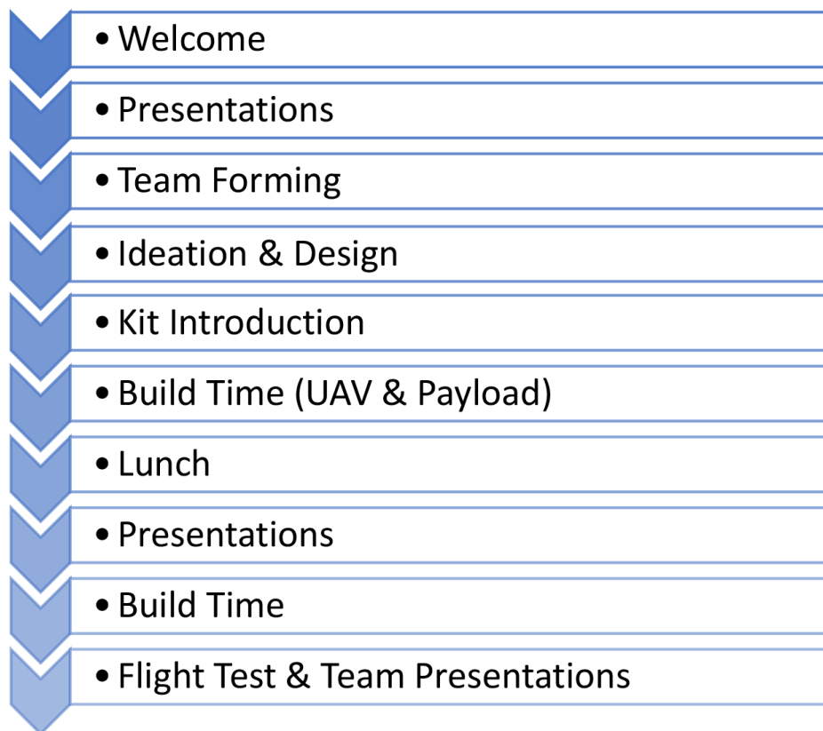
Figure 1 The Generic Flow of a DroneHack Event