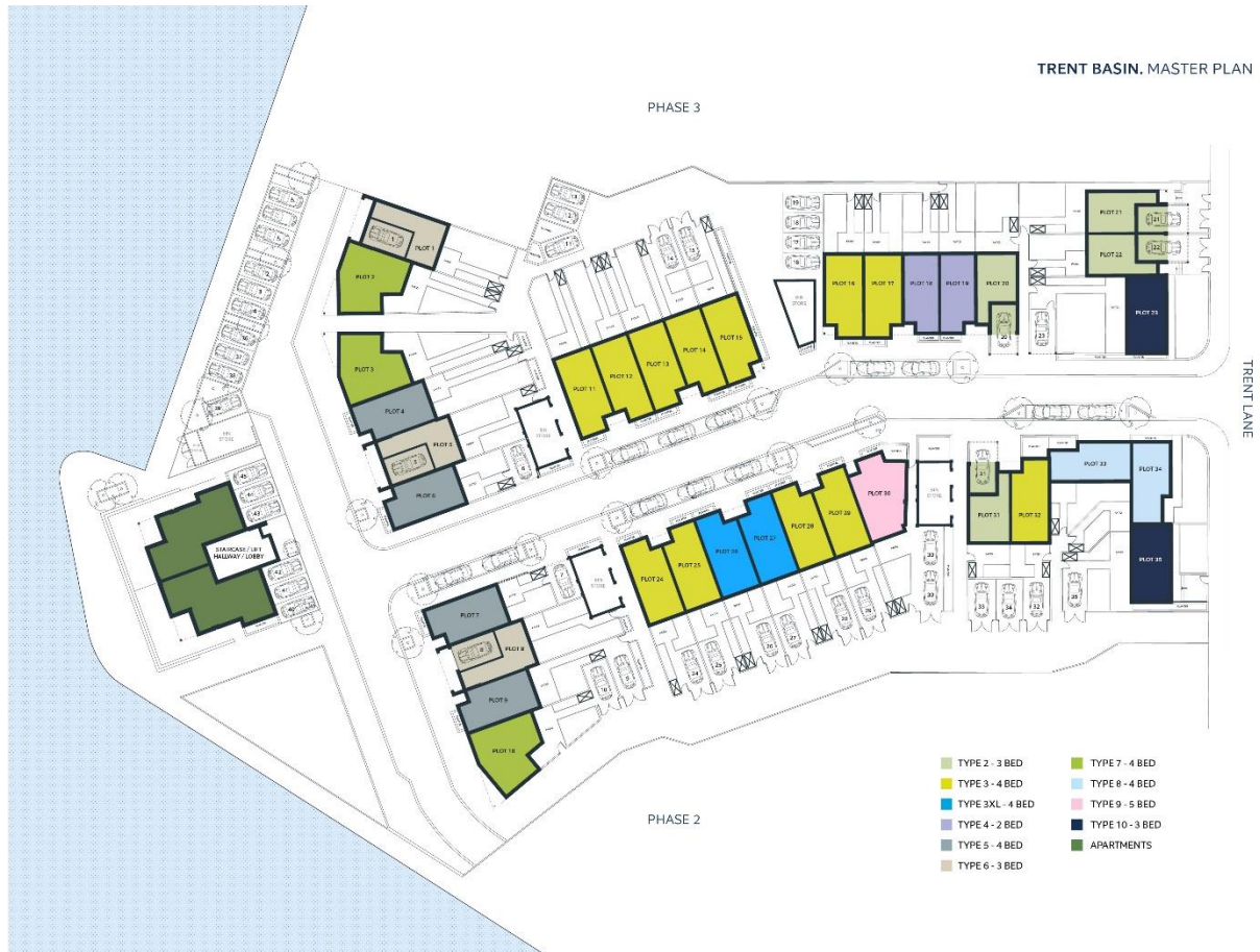
Figure 5 Plan of Phase One of the Trent Basin Development