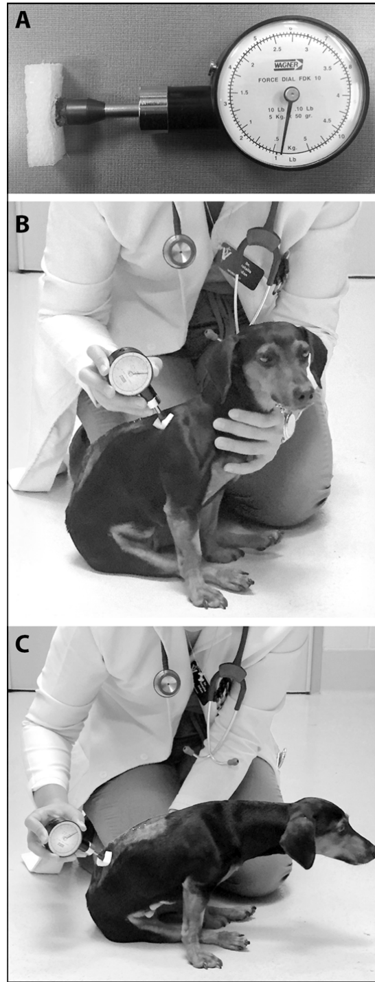
Figure 2: Mechanical sensory thresholds were measured using an algometer (a). Pressure algometry was performed at a control site between the scapulae (b) and at the level of the hemilaminectomy (c) by applying pressure to the paraspinal musculature. Measurements were performed in triplicate and the mean score calculated.