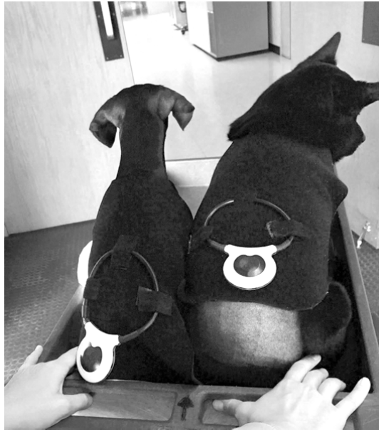
Figure 1: A treatment loop in place in 2 dogs, Velcro straps hold the loop centered over the epicenter of the spinal cord injury.