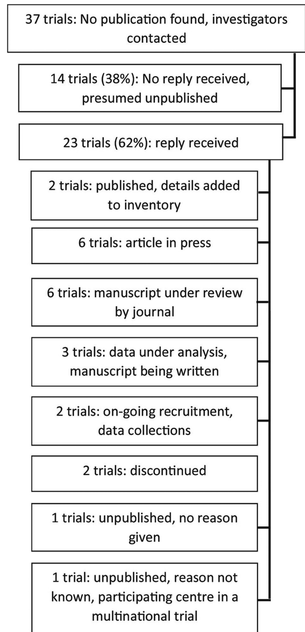
Figure 2 Audit flow chart of clinical trials that were overdue publication.

Fourteen of the 282 registered trials were registered on EuCTR which does not require an expected completion date to be uploaded at the time of registration. A further 77 trials were registered on the ISRCTN register (known originally as the International Standard Randomised Controlled Trial Number but now broader in scope). This allows only one completion date to be