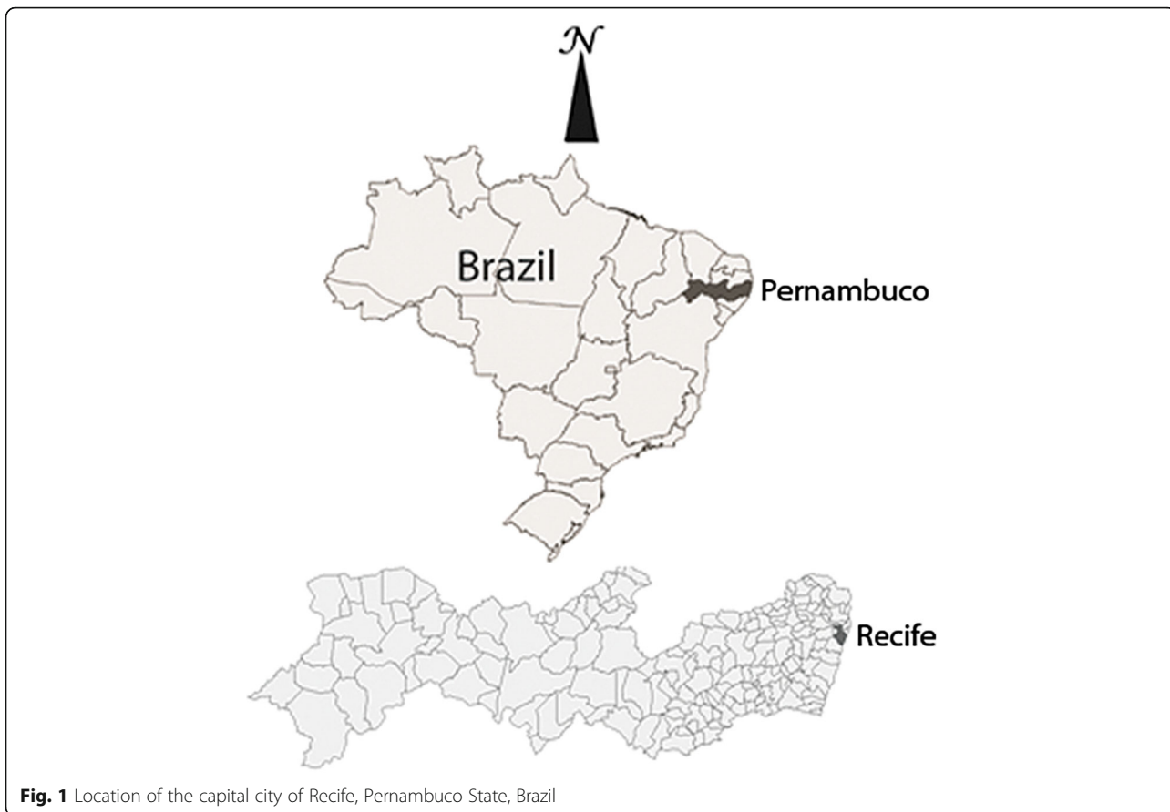
Fig. 1 Location of the capital city of Recife, Pernambuco State, Brazil

indicator used. It establishes intra-strata homogeneity and between-strata heterogeneity. Statistically, this aims to maximize the variance between the groups and minimize the variance within each group.