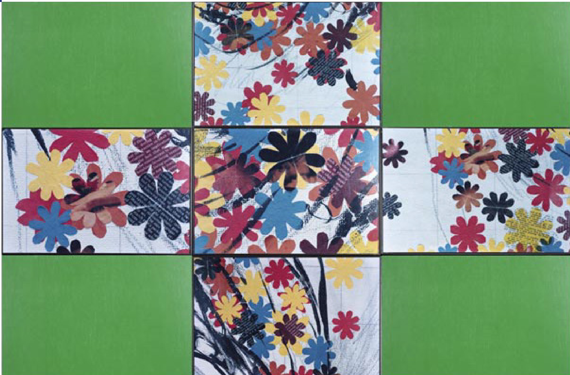
'Flowers', Rasheed Araeen, 1993 – 94, nine panels, mixed media, 51 × 76cm (overall 153 × 228cm)