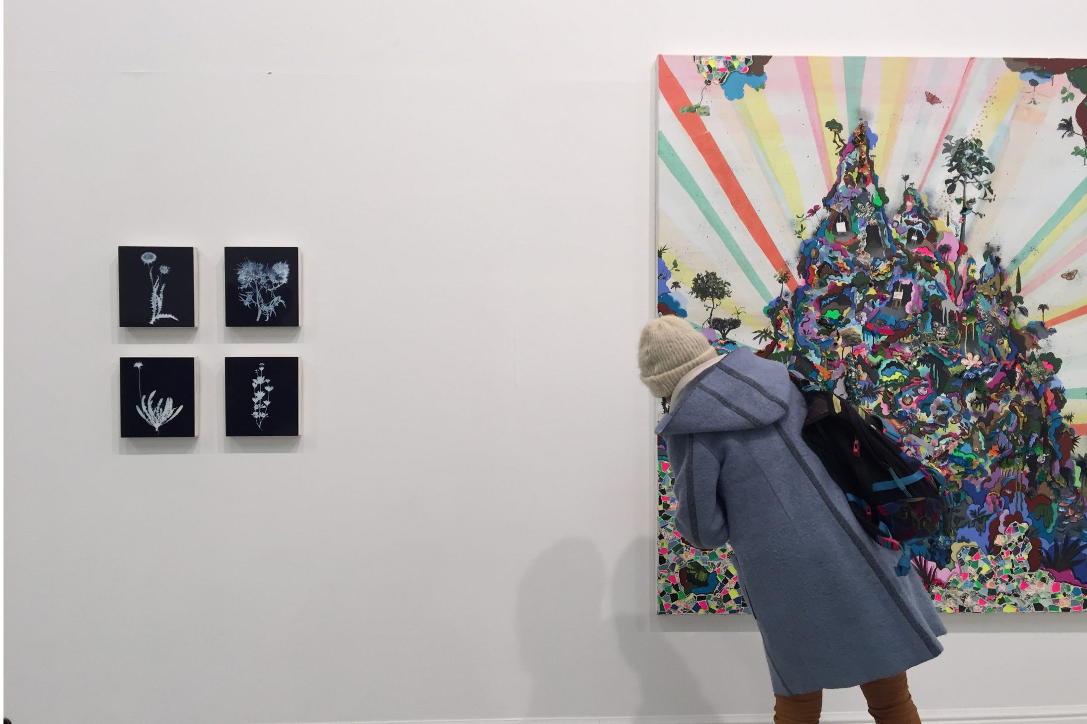
Phytopia curated by Edward Chell, Thames-Side Studios Gallery, London, 2 February - 5 March 2018