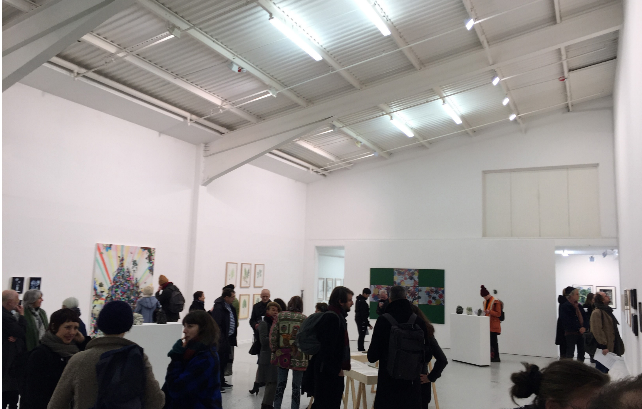
Phytopia curated by Edward Chell, Thames-Side Studios Gallery, London, 2 February - 5 March 2018