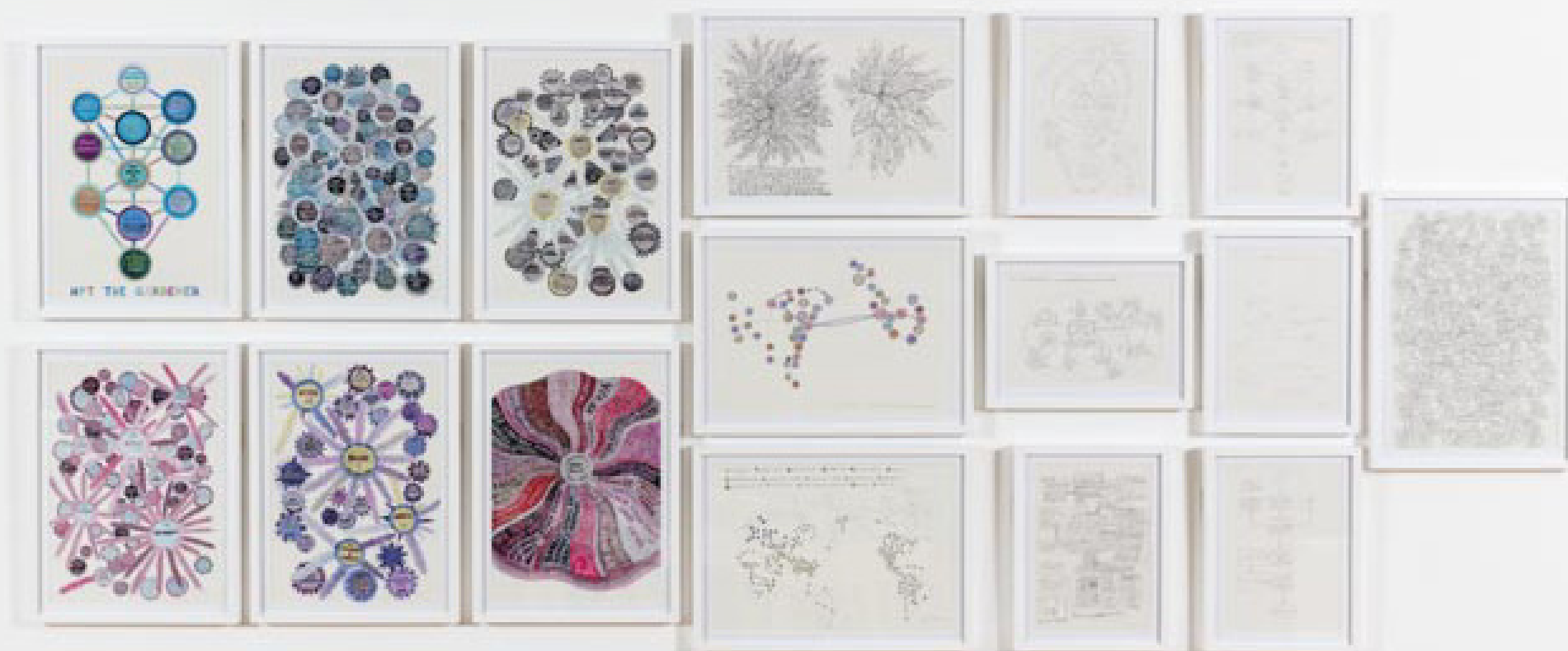
'HFT The Gardener', Suzanne Treister, 2016, sixteen panels, six at 21 × 29.7 cm; ten at 29.7 × 42 cm (part of a 174 panel work), archival giclee prints on Hahnemuhle Bamboo paper, courtesy Annely Juda Fine Art, London