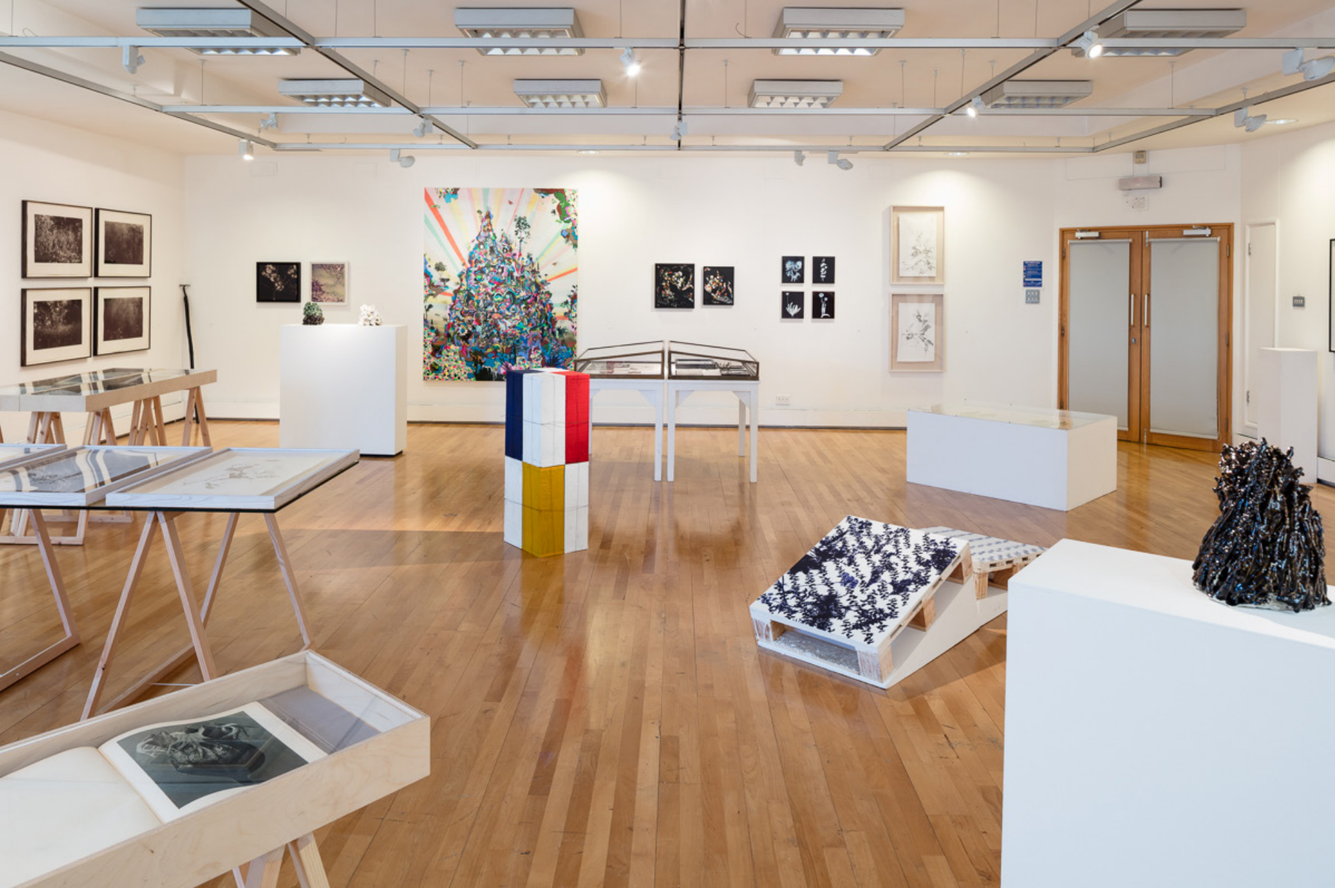
Phytopia (installation view), Glynn Vivian Art Gallery, Swansea, 15 February – 26 May 2019