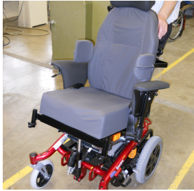
Figure 1. The Spectra XTR wheelchair (used at a local Posture and Mobility Service in North Wales) is the default model for our simulated powered chair. We can also change parameters in the software to support other chairs.