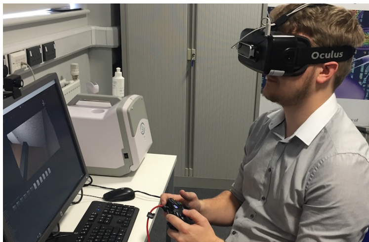
Figure 3. The Leap Motion is attached to the front of the Oculus Rift DK2 using the VR Developer Mount. The wheelchair control joystick is represented by one of the joysticks on an Xbox 360 Gamepad.

dent control of the two powered wheels, usually in the rear, and the free motion of pivoting front caster wheels. Direction changes are made by individually varying the speeds of the rear wheels. The interface between the user and the wheelchair itself is often the most critical component. Hand-operated joysticks with proportional control are now the de facto interface for most wheelchair users. They do not rely on the users strength in the upper limbs to operate wheels nor require a permanent assistant pushing from behind. Our simulated wheelchair (Figure 2.) attempts to recreate this feature as faithfully as possible.