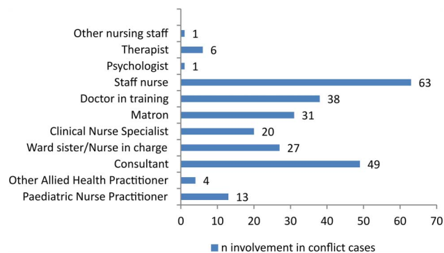
Figure 1 Staff involvement in conflicts experienced.

difficulties 18 and religious beliefs. 19 Other studies have suggested that conflict may arise when relatives are not fully supported to understand treatment and care decisions. 20 Underpinning each of these causes can be different understandings of the clinical situation 21 and different interpretations of futility 22 and likely prognosis. 11