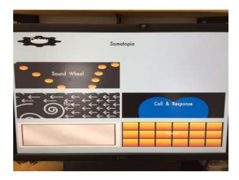
Figure 4 Somatopia Interface

In addition, the Options Menu allows for the video image to be turned on or off and enables the use of the camera to take still images. Still images can be saved into the Somatopia folder on the Raspberry Pi interface and added to Sound Wheel.