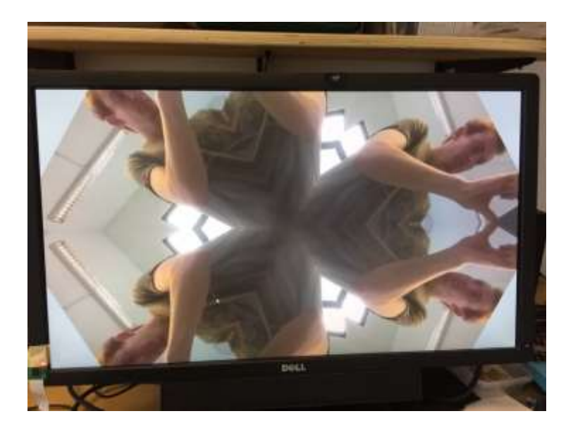
Figure 3 Mirror

Mirror: this generates kaleidoscopic patterns, which can be altered using the computer mouse. It provides an opportunity to explore naturally occurring bodily rhythms or compose a collective rhythm.