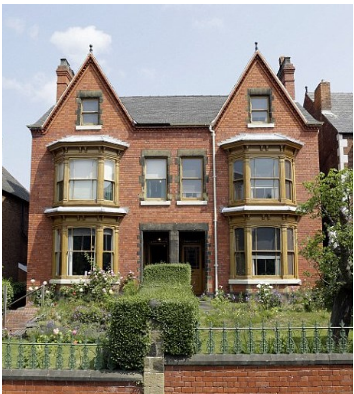
Figure 3. 5-7 Blyth Grove, Worksop, Nottinghamshire