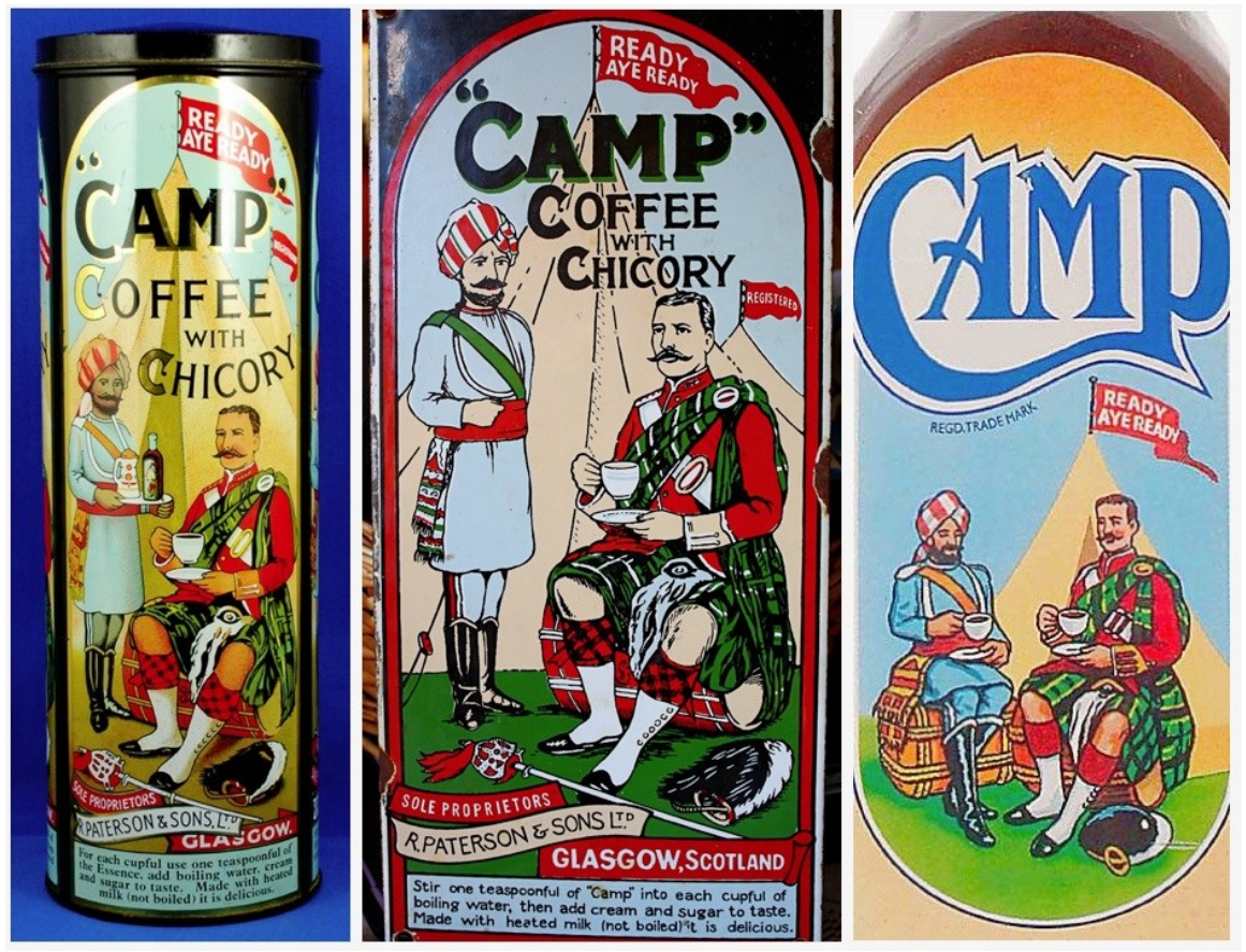
Figure 4. Changes in Camp Coffee label