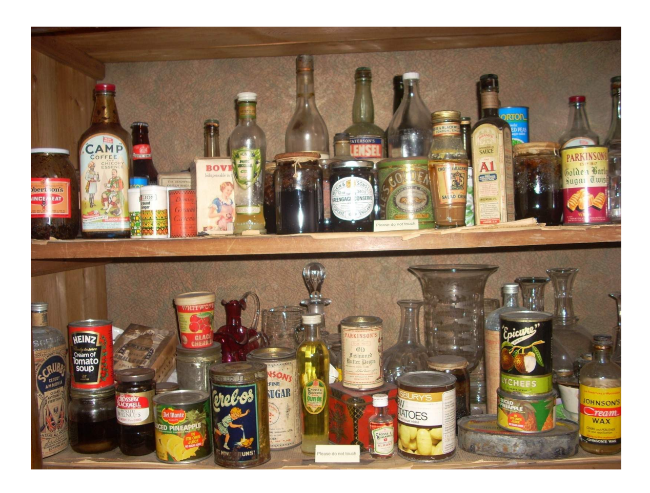
Figure 1. Larder in Mr Straw's House