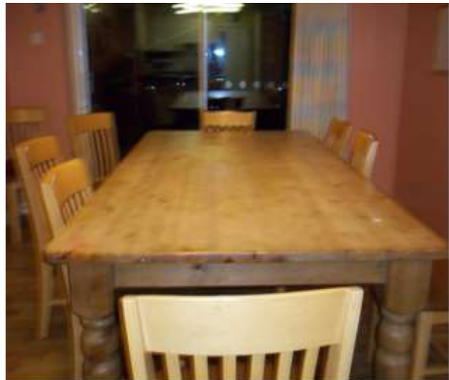
Figure 2 Close up of the dining table.

The dinner table. Here we sit and have meals together. Sometimes we also just sit and talk.