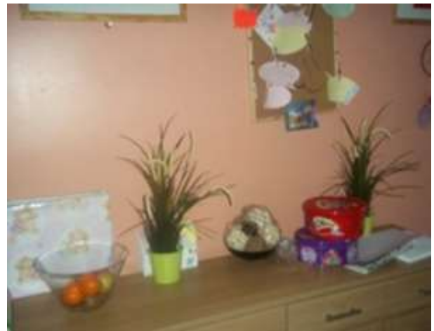
Figure 3 The sideboard.

Figure 3 is an image taken by Pat when asked to imagine what it would be like to live in the residential home. The dominant object is a sideboard that takes up the lower half of the image. The sideboard is covered in different objects including two tall plants, a couple of large sweet tins and a fruit bowl. On the wall is a notice board and the edges of two pictures.