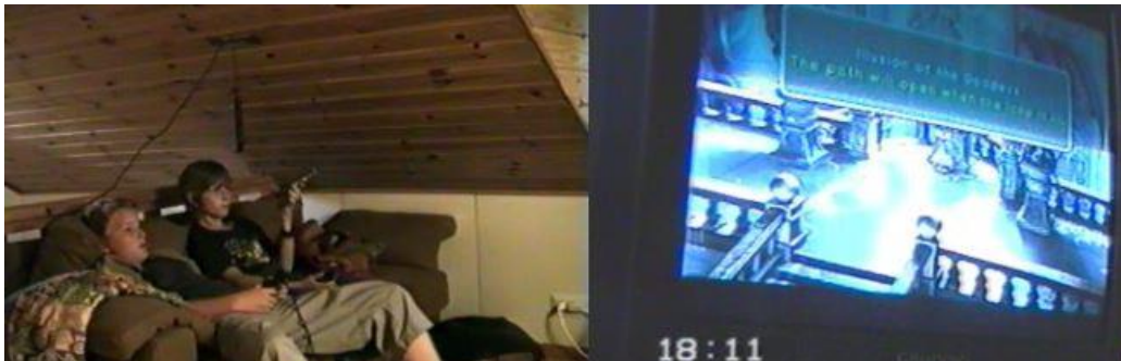
Fig. 2. Illusion of the goddess. The path will open when the lamp is lit.