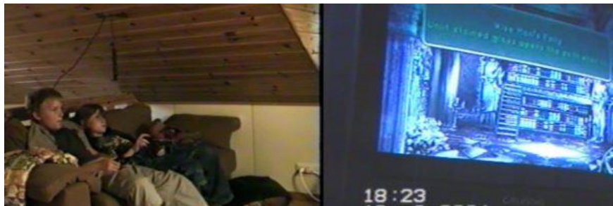
Fig. 3. Wise man's folly. Unlit stained glass opens the path when lit.