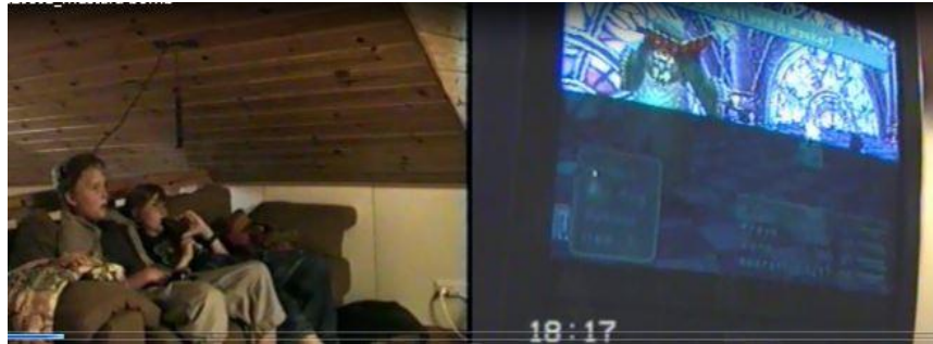
Fig. 1. Quina: I no can eat until weaker.

3 → P [I can't eat until viik:er weaker [ ((selects attack))