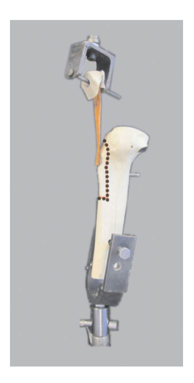
Figure 2. The biomechanical test setup used in the study. The dotted line indicates the osteotomy site.

proximal step-off described by Fulkerson et al<sup>8</sup> was not performed, as our intention was to test the fixation without any additional mechanical support (worst-case scenario). The free osteotomized fragment, which included the patellar tendon insertion, was secured back to its original position with a single, fully threaded bicortical 4.5-mm metal or bioabsorbable screw. The screw was centrally placed in the osteotomized fragment and was oriented parallel to the long axis of the tibia and the axis of distraction. To obtain bicortical fixation, the lengths of both the metal (50 mm) and bioabsorbable (60 mm) screws were chosen to exceed the anteroposterior diameter of the proximal tibia. The bicortical fixation of the tuberosity fragment was confirmed visually. To further standardize the specimen preparation, a single surgeon (J.T.N.) performed the osteotomy and fragment fixation.