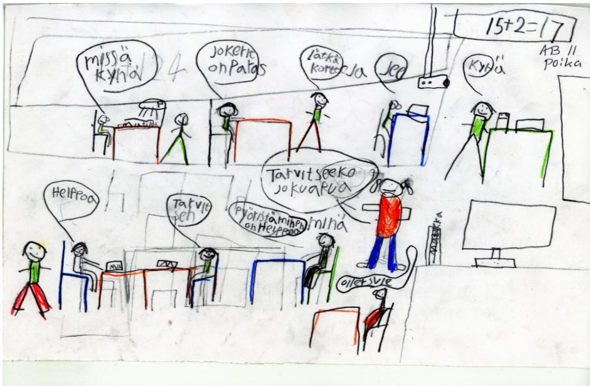
Figure 1. A positive emotional atmosphere (a boy's drawing)

In figure 1 the drawer ( minä ) is smiling and thinking that ("Rounding is easy."). The teacher is the tallest figure in the drawing. She is asking ("Does anyone need help?"). In the upper row starting from left a pupil asks ("Where is the pencil?"). The pupil sitting in the next desk says or thinks ("Jokerit (a Finnish hockey team) is the best."). The pupil standing near this desk says or thinks ("Hockey cards"). The pupil in the right corner says ("Pencil"). All these talks or thoughts were evaluated as neutral. In the bubbles of the pupils sitting in the lower row opposite to each other it is written ("Easy") and ("I need."). The latter pupil is probably answering the teacher's question but as they are smiling this remark was interpreted as neutral. The pupil in the lower corner says or thinks that ("Oilers (a Finnish floor ball team) is winning.")