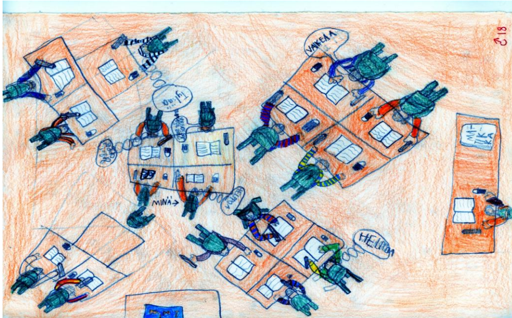
Figure 2. An example of an ambivalent emotional atmosphere (a girl's drawing)

The drawer ( minä ) is sitting so that her face is not visible. She is thinking ( “Easy” ). The teacher is sitting behind her/his desk in the right side of the picture and looking at a book on her/his desk. In the group upper left hand corner the pupil thinks ( “Boring” ). In the drawer's group in the middle of the class the pupil diagonally opposite the drawer is thinking of a calculation and then s/he asks the teacher ( “ 8 + 8 = ? , teacher” ). The pupil next to her/him shouts ( “Teacher! Here! Now!” ) The pupil in the group upper right hand corner is saying ( “Hard” ) and the pupil in the group down right is thinking ( “Easy” ).