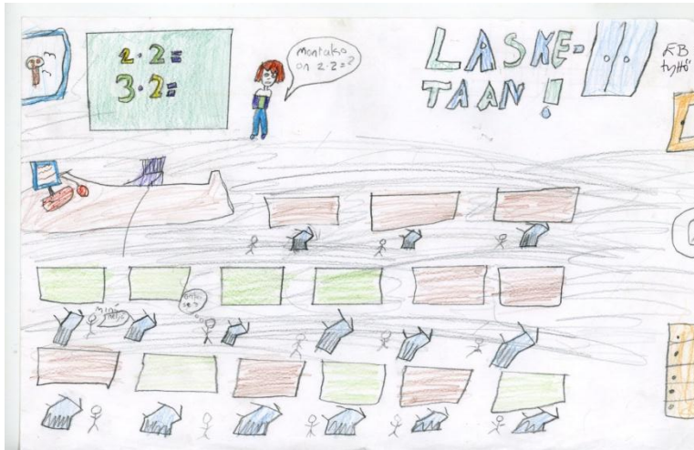
Figure 4. An example of a neutral emotional atmosphere (a girl's drawing)

The teacher with her mouth like a line (neutral) is standing in front of the class. She asks ("How much is 2 \times 2 ?") The drawer ( minä ) is standing in the second row on the left and is answering to the teacher's question ("4"). The pupil on the drawer's right hand side is thinking ("Is it 3?"). Pupils are like stick figures without faces. On the blackboard it is written Let's calculate!