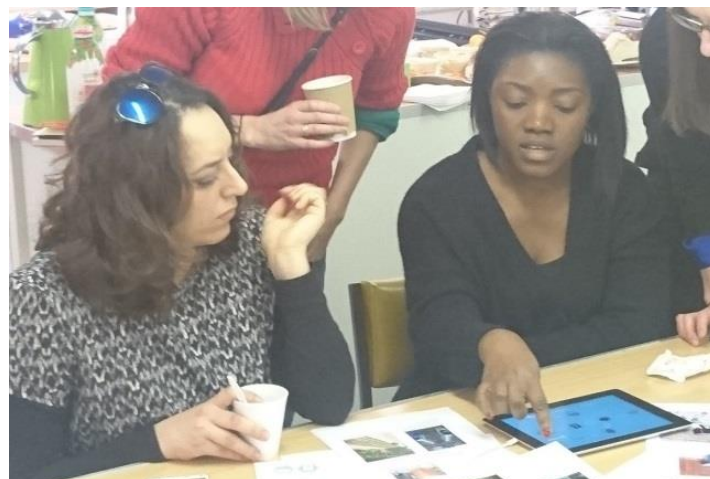
Figure 3: Using LCA Calculator on tablet computer to evaluate impacts of infrastructure options

The second workshop provided participants with factsheets and photographs of the candidate technologies, which were then analysed using a bespoke LCA Calculator developed specifically for the project (Figure 3). Participants explored scenarios based on the five shortlisted technologies and at the end of the workshop voted to develop rainwater harvesting as the preferred option.