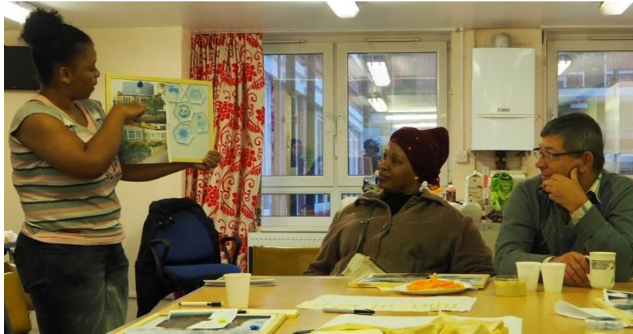
Figure 2: Using Co-design Tokens to discuss infrastructure options