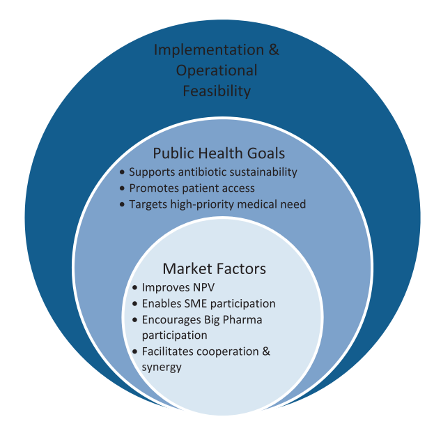
Figure 2 Framework evaluation.

The results section will present short case studies of each of the initiatives that were assessed. We provide a summary of an initiative's