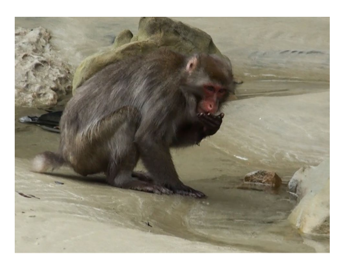
Fig. 4 Japanese macaque washes wheat on Koshima beach

'Wheat washing' (WW, also called 'sluicing' or 'placer mining;' Hirata et al. 2001) entails wheat grains being scattered/dropped/rinsed in water. Initially when wheat grains were scattered on the beach, the monkeys painstakingly picked up the individual grains one-by-one with thumb and forefinger opposition. The first behavioral variant emerged in 1956, when Imo picked up a mixture of wheat grains and sand from the beach, carried this mixture to the water's edge,