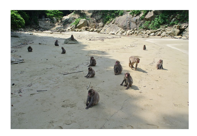
Fig. 2 Japanese macaques on the beach at Koshima

were given mainly two staples: unwashed sweet potatoes were dumped and unhusked wheat grains were scattered on the sand. (Wild monkeys are well known to be crop-raiders that "grub out" sweet potatoes and pilfer rice from farmers' fields; Kawamura 1972.) Initially, the macaques used their hands or body hair to brush away sand from the potatoes (Watanabe 1994). However, in 1953, a 1.5-year-old juvenile female named Imo started 'sweet potato washing' (SPW) ('dip and brush' in Table 1), and the behavior quickly spread to other individuals in the group (Kawai 1965). Four phases