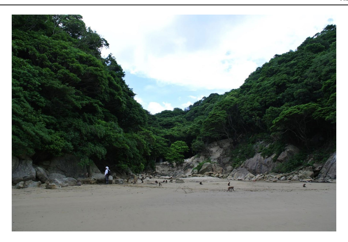
Fig. 1 View from shoreline of the beach and forest on Koshima island