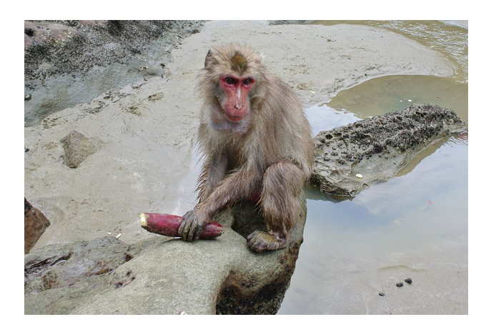
Fig. 3 Sweet potato washing on the beach at Koshima

geo-helminthic infection (Sarabian and Macintosh 2015). Emergence of new hygienic variants (e.g., from simply dipping and brushing to immersing and rolling) may represent (unintentional but potentially useful) cumulative progress in reducing the risk of acquisition of harmful parasites.