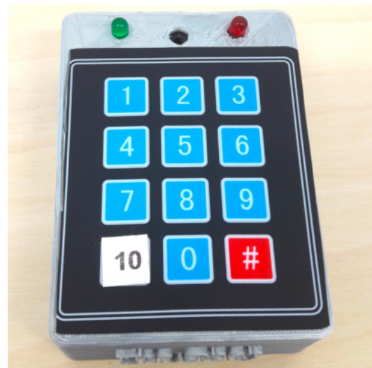
Figure 1. Painpad, a tangible device for inpatient self-logging of pain.

DOI: https://doi.org/10.1145/3173574.3173743