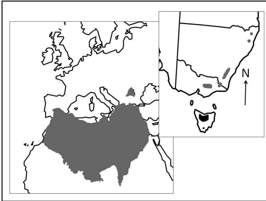
Figure 1 Main figure . Comparison of latitude and area of Europe and Australia (adapted from Turnbull and Eldridge 1983). Insert on the top right, and showing the natural distribution of Eucalyptus gunnii (black) and Eucalyptus nitens (grey) in southern Australia are given in black and grey, respectively. (Brooker and Kleinig 1990).