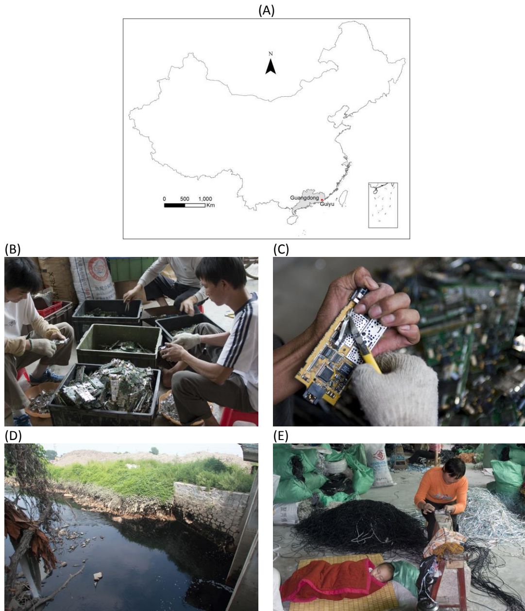
Figure 3 Informal waste recyclers working on waste electrical and electronic equipment (WEEE) and associated environmental and health risks in Guiyu, China.

(A) Guiyu in Guangdong, South China; (B) WEEE are preliminarily processed by hand; (C) Primitive technology is used to extract valuable heavy metals from WEEE; (D) The river in Guiyu is polluted by secondary waste produced by WEEE recycling; and (E) Families live near WEEE recycling works with poor protection from associated dangers to health.