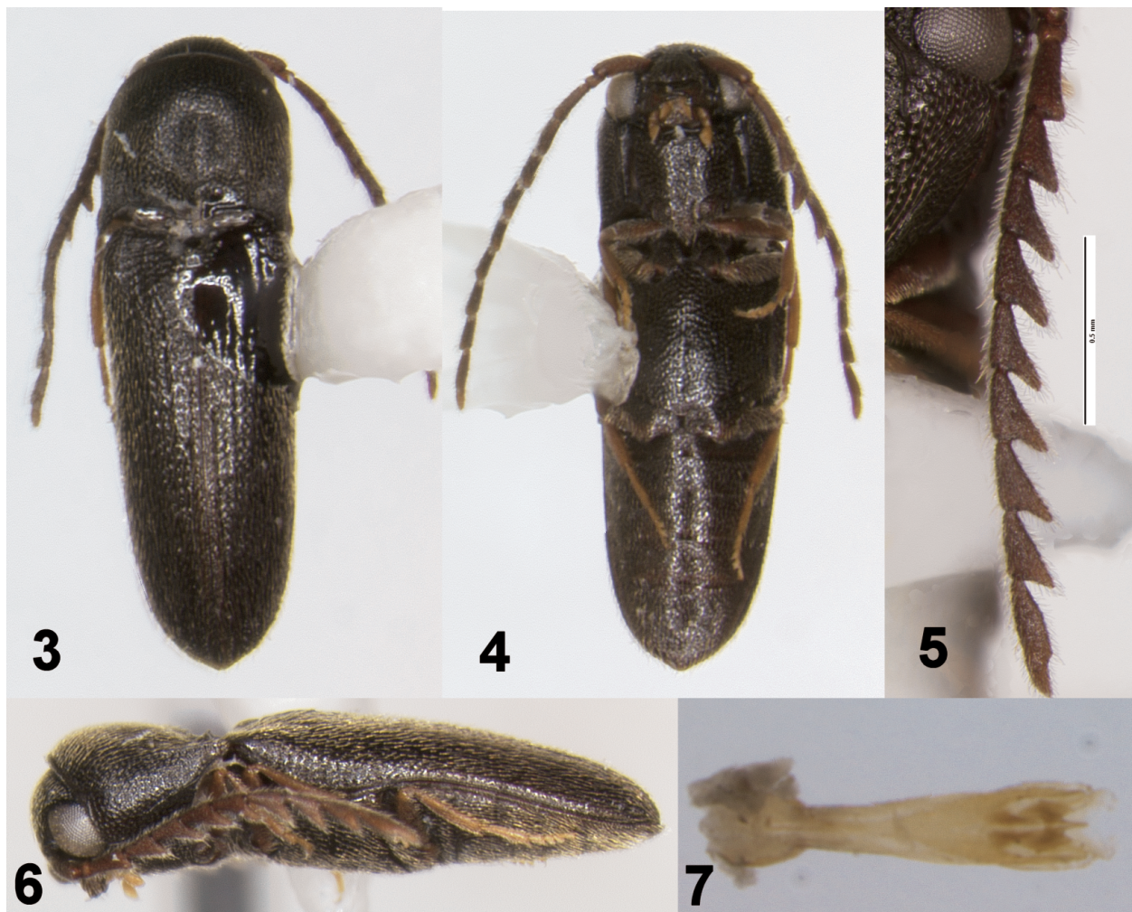
Figures 3-7. Microrhagus brunneus Otto. 3) Dorsal of holotype. 4) Ventral of holotype. 5) Antenna of holotype. 6) Lateral of holotype. 7) Aedeagus of paratype, dorsal view.