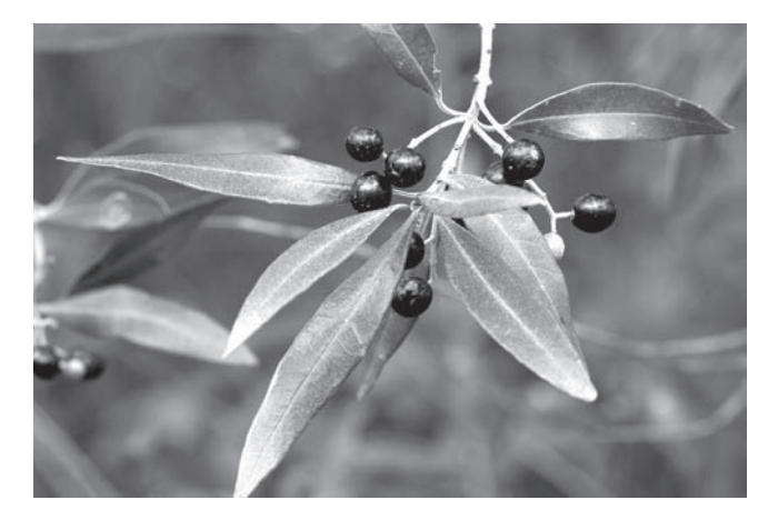
Fig. 1. African Olive fruits (7-10 mm diameter) ripen during winter and are attractive to birds.

habitat attract a range of fruit-eating birds eg. pigeons, parrots, louries, mousebirds, bulbuls and starlings (Venter & Venter 1996). The fruits are also eaten by monkeys, mongoose and humans (Pooley 1993). The leaves are used to make a tea, a gargle for sore throats and an eye lotion (University of Pretoria 2004). Wood produced is close grained, strong and very hard (Palgrave 1983). Due primarily to over exploitation of its useful timber, African Olive is considered threatened in some African regions and is a protected tree in the Northern Cape, Free State and North-west Provinces of South Africa.