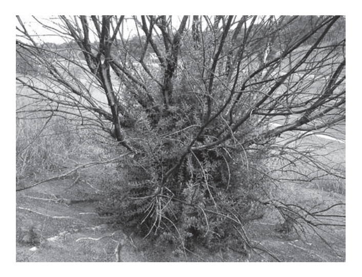
Fig. 7. Mature African Olive resprouting 18 months after fire; seedlings and young plants less than about a metre high are generally killed by fire.