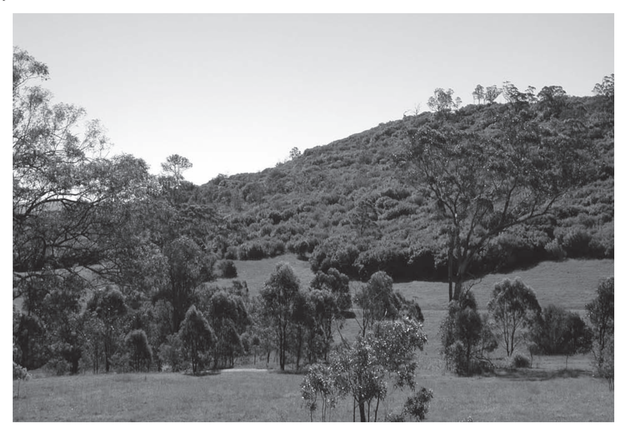
Fig. 4b. The same view in 2004, part of Mount Annan Botanic Garden since 1988, showing increased density and local expansion of African Olive plants. Recruitment of native eucalypts has taken place in the foreground where Olive has been controlled by spot herbicide application and mowing.

Fig. 4a. The eastern side of Mount Annan in 1984 as a grazing property, with African Olive plants already well-established on the steeper slopes.