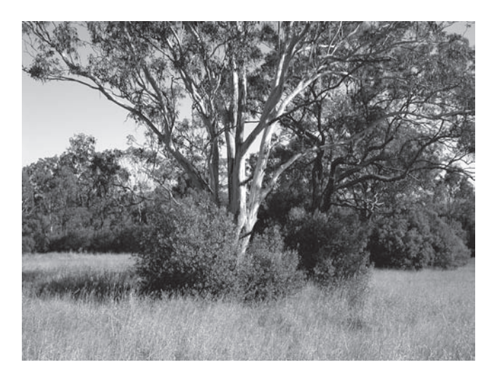
Fig. 6. Birds deposit the woody seed endocarp under perch trees - providing a source point for African Olive infestation.