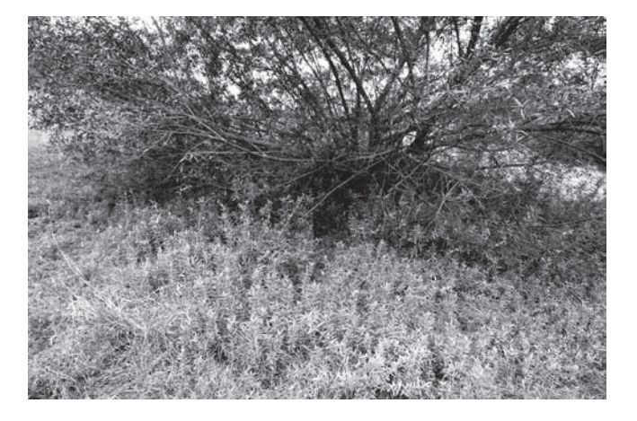
Fig. 5. Dense seedling 'mats' form in the seed-fall zone around mature African Olive plants – providing a 'seedling bank' for future recruitment.

There is a strong case for African Olive to be declared a noxious weed throughout western Sydney and the Hunter Valley regions, and co-managed with Privet ( Ligustrum spp) under Class 4 weed control plans. A re-evaluation of the most effective control techniques, including currently registered herbicides, is also required.