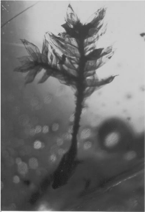
Fig. 3: Calyptothecium duplicatum (Teuber 1672)

particles. It contains a moss of 12 mm length, which is much eroded. The plant has three branches on the upper part, one of them producing a flagelliferous shoot. The leaves are rounded with obtuse, erose dentate apex and ecostate. The laminal cells are oval. Although the plant is much distorted, the leaves resemble those of Homalia and the presence of flagelliferous shoots H. glabella .