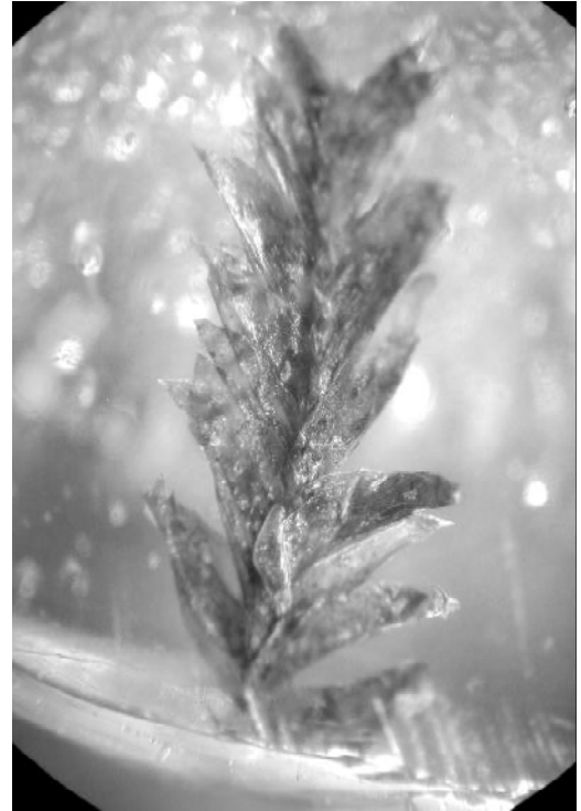
Fig. 2: Entodon macropus (Frahm D2)

Buck (1998) enumerates 3 species from the Caribbean: H. amabile , H. polypterum and H. cupressiforme . The former two have plicate leaves with serrate margins, which does not match this fossil. The third extant species, H. cupressiforme , is characterized in the Caribbean by concave, non plicate leaves and (compared to other species of Hypnum and other origins of H. cupressiforme ) less falcate second leaves. It resembles much this fossil specimen, although a definite determination seems to be impossible without being able to study characters such as alar cells, which are not visible on the fossil. It is, however, not identical with the fossil Hypnum spec. listed by Frahm (1993), which has stronger curved leaves and serrate leaf margins, thus resembling H. amabile or H. polypterum , which were taken into account for that specimen. If this specimen would belong to H. cupressiforme , it would be remarkable that this morphological aberrant population on Hispaniola did already exist in Tertiary.