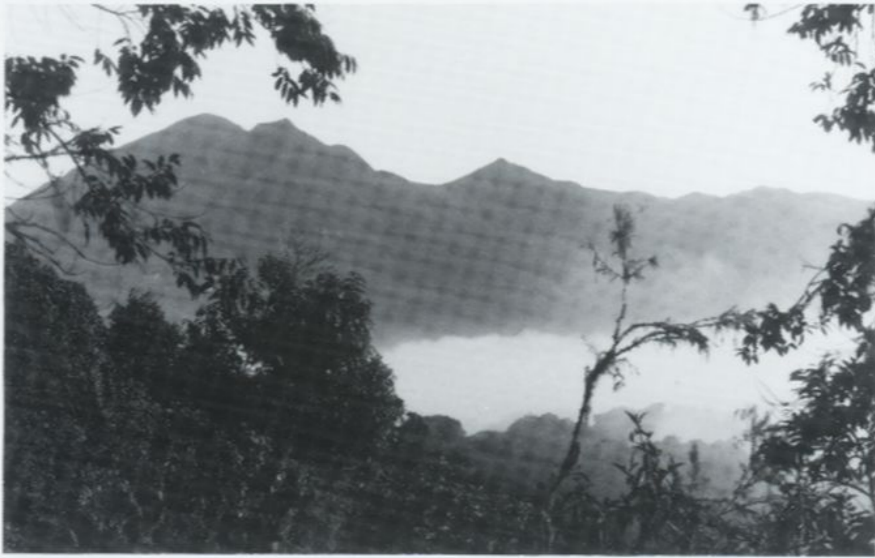
Fig. 3: Mt. Kahuzi seen from South, collecting sites 144-150.