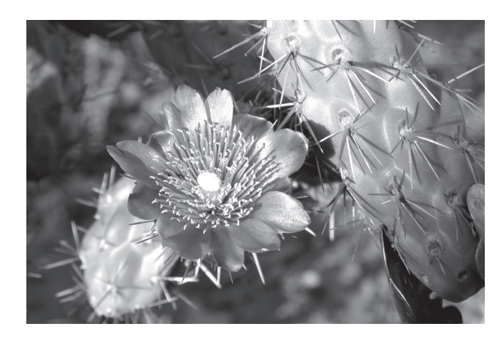
Fig. 2. Cylindropuntia prolifera is one of the many Cylindropuntia species naturalised in opal field areas of northern N.S.W.

New South Wales Distribution / Habitats: Central Tablelands. Naturalising at Lawson where it is growing with native and other exotic species.