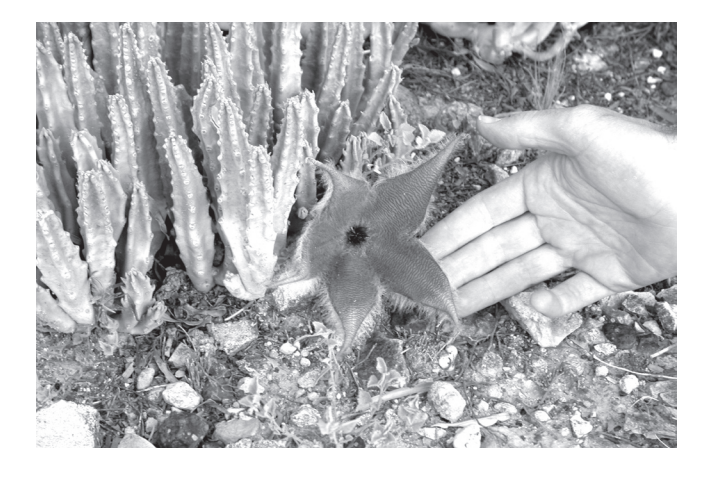
Fig. 1. Stapelia gigantea has large flowers that attract blowflies for pollination. This succulent is spreading via wind-dispersed seed in the Lightning Ridge area.

New South Wales Distribution / Habitats: North Western Plains. Known from a number of locations in and around Lightning Ridge where it is found growing below trees and shrubs, often as the dominant species.