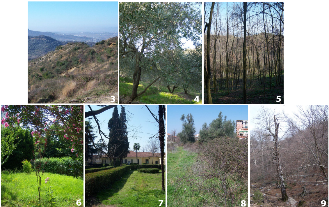
Figs. 3–9: Localities (3: L1, 4: L2, 5: L3, 6: L4, 7: L5, 8: L6, 9: L7) where were placed pit fall traps, listed from West to East of Tirana

In total, 400 specimens of spiders including 310 males and 90 females, representing 78 species from 49 genera and 24 families were collected. Seven spe-