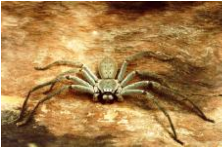
Fig. 1: Isopeda villosa from Batemans Bay (New South Wales, Australia).

New South Wales and the Great Dividing Range. A single gravid female escaping into suitable habitat could lead to a new addition to the sparassid fauna of New Zealand. Indeed, I. villosa has been collected from several localities around Auckland over the years (six since 2001) without direct links to recent imports. This suggests that this species may be locally established. It was initially reported from Takapuna, Auckland in 1995 (GH) and a second specimen was found in the same area in 1996. Subsequently, records from Panmure (1992), Helensville (1994) and Otahuhu (1999) became available (GH).