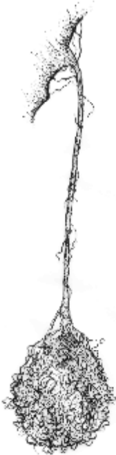
Fig. 1: Eggsac of Ero arphana .

Although mimetids can be relatively abundant in suitable habitats, they are generally collected only as single specimens in pitfall traps or vacuum samples. Turning over rocks or fallen bark may also yield mimetids in areas where their prey spiders are abundant. However, the best way to collect males, usually the sex that allows accurate species identification, is at night when they are wandering around in search of a mate and may be found entering webs in trees or on walls.