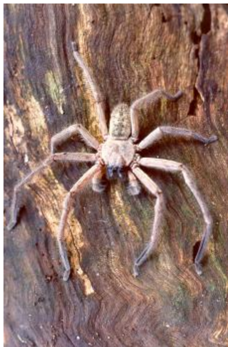
Fig. 1: Delena cancerides (male)

digital images or of the actual specimens (Table 1).