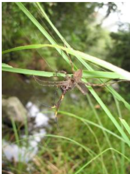
Fig. 1: Megadolomedes australianus feeding on Nephila .

Northbrook Creek (27°18'16.8" S, 152°42'34.3"E) is a narrow creek in Brisbane Forest Park, running through