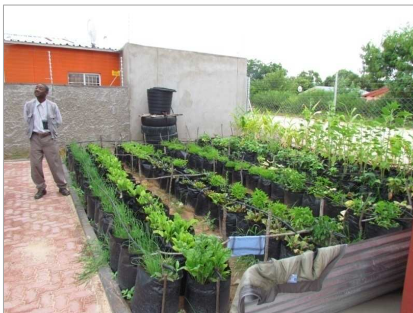
Small-scale drip irrigation, Rundu urban 2011

Initiatives that promote small-scale gardening are not well documented. With the exception of the Integrated Initiative in support of urban and peri-urban horticulture development which is implemented by the Ministry of Agriculture Water and Forestry, all other small-scale horticulture projects are implemented by NGOs. The Ondangwa based NGO, Creative Enterprise Solutions 3 , for example, supports small-scale drip irrigated production of vegetables in parts of the north-central regions and Kavango Region. A detailed assessment of the extent of small-scale horticultural production was beyond the scope of this assignment. However, such an exercise may yield important insights that may reduce the risk of failure of new gardens.