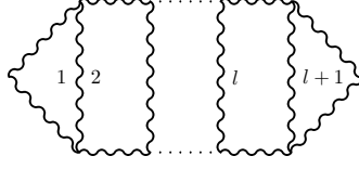
Figure 1: Feynman diagram contributing to the pressure.