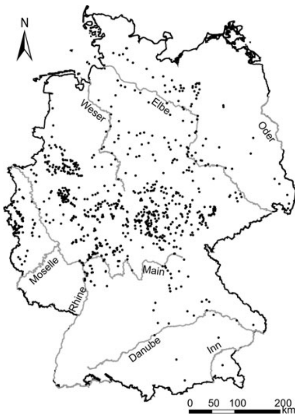
Figure 1. Map of the location of the 981 sampling sites located in small to large rivers in Germany. Additionally, the eight largest German rivers are indicated in the map.

Invasion risk of sampling sites with regard to general environmental conditions was analyzed using the principle