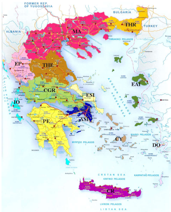
Figure 1: Map of different geographical regions in Greece.

sidæ – 1, Uloboridae – 1, Nesticidae – 4, Theridiidae – 4, Anapidae – 1, Linyphiidae – 16, Tetragnathidae – 4, Araneidae – 1, Lycosidae – 1, Agelenidae – 21, Amaurobiidae – 4, Gnaphosidae – 6, Philodromidae – 1, Thomisidae – 2, Salticidae – 2 (Table 1). One species is new for the Greek spider fauna: Porrhomma convexum (Westring, 1861) (marked in the list with *), a spider with a Holarctic distribution and widespread in European caves. It is also well represented in the caves of the Balkan Peninsula – and not only established in the caves of Croatia, Romania and Turkey (DELTSHEV 2008). The number of species is high and represents about 13 % of the Greek spiders. This is also evident from a comparison with the number of cave-dwelling spiders recorded from the other countries of the Balkan Peninsula: Bulgaria – 99, Croatia – 63, Serbia – 59, Bosnia and Herzegovina – 52, Macedonia – 44, Montenegro – 44, Slovenia – 43, Albania – 10, Turkey – 8, and Romania – 4 (DELTSHEV 2008). The established number of species, however, depends not only on the size of the regions, but also on the degree of exploration. The most characteristic are the families: Leptonetidae (8.2 %), Pholcidae (9.2 %), Dysderidae (11 %), Linyphiidae (14.6 %), and Agelenidae (19.2 %). The families with largest number of anophthalmic species are Leptonetidae