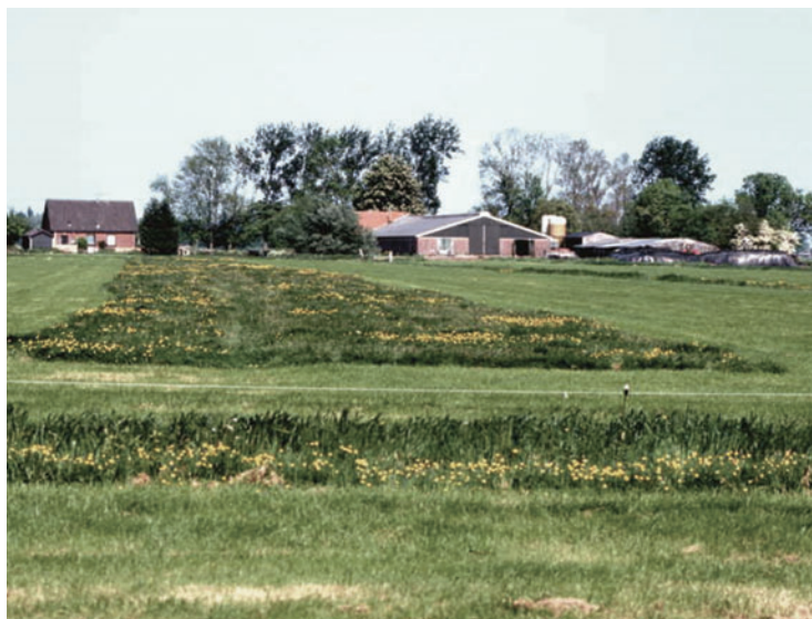
Fig. 3: 'Refuge strip', part of the field is skipped during mowing to preserve feeding habitat and shelter for meadow bird chicks.

On the whole, chick survival in this study was poor to very poor in comparison with earlier measurements in Dutch Black-tailed godwits. Combined with a relatively low hatching success of nests, this led to low numbers of chicks fledged per pair. Just one of the estimates from experimental areas (0.72) exceeded the value required of ca. 0.6 fledged young per pair (Fig. 2). In one other experimental site, productivity fell not much below the threshold, but all other estimates (including controls) fell below 0.3 fledged young per pair. Thus breeding success was insufficient for a self-sustaining population in both mosaics and control areas.