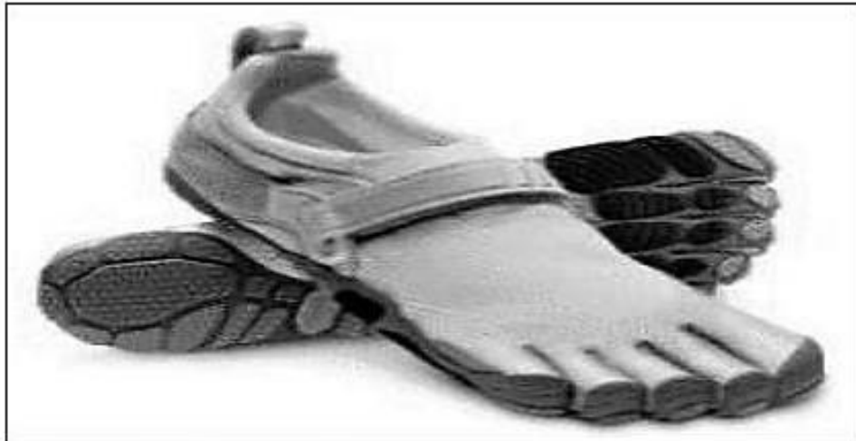
Figure 3. Vibram Fivefingers® minimalist shoes (MIN)