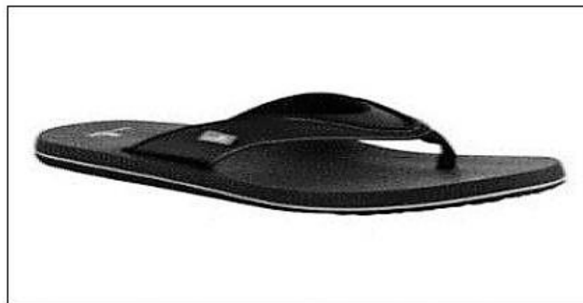
Figure 2. Thong-style flip-flops (FF)