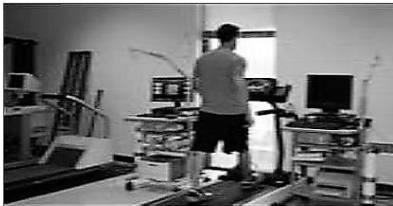
Figure 4. Participant walking at preferred pace while wearing selected footwear