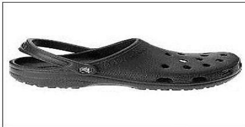
Figure 1. Croc® slip on shoes (CROC)

indoor track. Participants were timed over the middle 50 feet during each trial and preferred pace was determined as the mean pace traveled over those 6 trials in a manner previously described (Browning & Kram, 2005; Chander, Morris, Wilson, Garner, & Wade, 2016; Loftin et al., 2010; Morris et al., 2014; Morris, Garner, Owens, Valliant, & Loftin, 2016). Indirect calorimetry was employed to measure oxygen consumption and related variables during treadmill walking or running using the ParvoMedics TrueOne 2400 (Sandy, Utah) measurement system. Once on the treadmill, participants stood for 5 minutes to assess standing ambulatory rest. Then after a brief warm-up, participants walked a one-mile distance at their preferred pace. Immediately following completion of the one-mile walk, participants stood quietly on the treadmill for an additional period to assess excess post-exercise oxygen consumption (EPOC). This EPOC period lasted for five minutes which for every participant was long enough for the participant to return to resting VO_2 as measured during standing ambulatory rest. The entire procedure was repeated for the three footwear conditions presented in a randomized order. The participants were given at least 48 hours of rest in between their testing sessions.