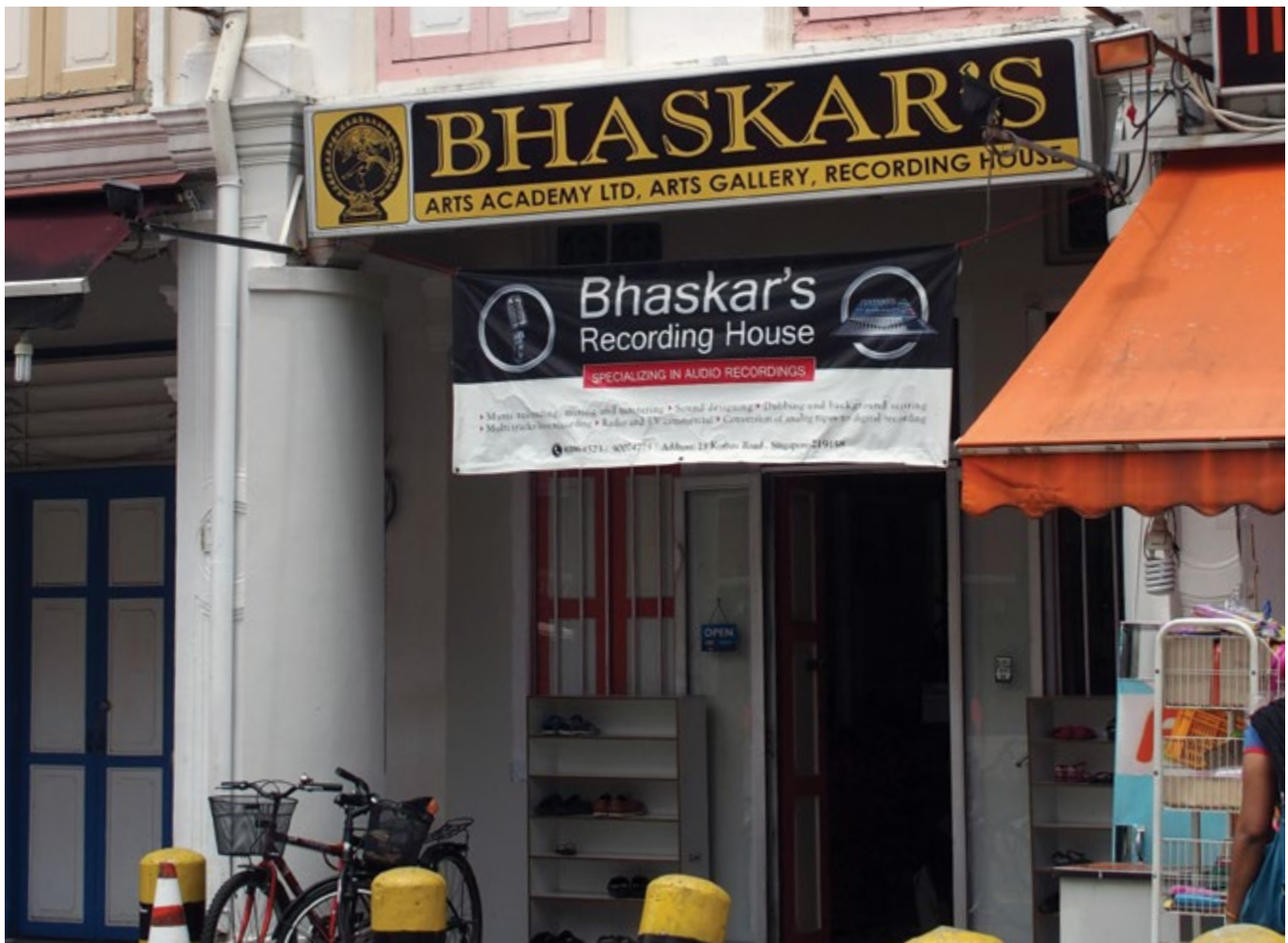
Bhaskar's Arts Academy premises, subsidised by the Arts Housing Scheme