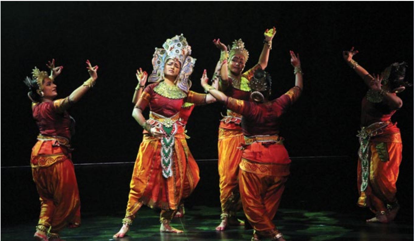
Anjasa, an event managed by Praapthi and staged by Apsaras Arts, at the Victoria Theatre, 2015

lighting and sound technicians, make-up artistes, instrument suppliers and repairers, and costume makers and renters who are also enablers of the Indian arts worthy of mention.