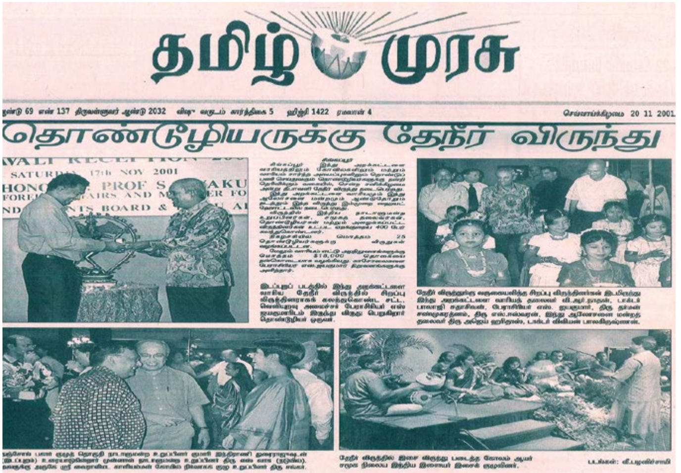
Cultural coverage in the Tamil Murasu, 2001

arts. When the newspaper was revamped in 1999, the page was renamed Kalai Murasu (Arts Drum) which ultimately led to the creation of the Lifestyle Section of the paper. This section publishes articles that encourage and motivate young artistes as well as veterans through curtain raisers, reviews, comments, interviews and the listing of arts events. Tamil Murasu is the print medium that has been the forerunner in creating awareness about the Indian arts scene in Singapore.”